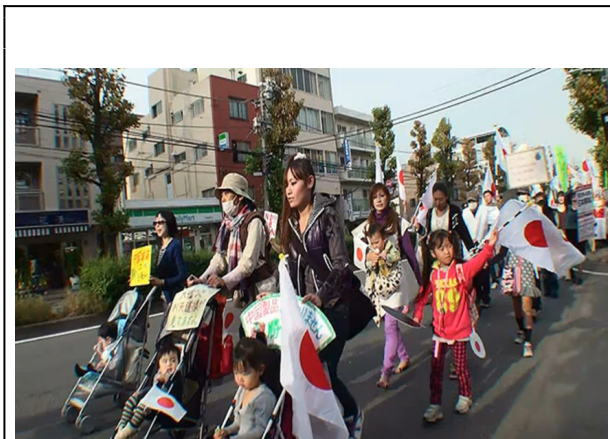
Figure 5: Young patriotic mothers marching with their children. Source.

Niconico dōga, and Channel Sakura/Japan Front Sakura, 2channel online forums, organizational websites, Twitter, and chat rooms. Furthermore, another extremely important method that the women's groups are employing is lobbying politicians and like-minded civic group organizations nationally and internationally to widen their activism.