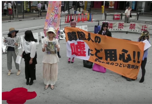
Figure 3: Hanadokei’s performance in Nakano, Tokyo.

Hanadokei is a regular women’s group and we do not have any affiliation with other groups or political organizations. We are just ordinary people. Today’s theme is about being cautious concerning Korean people’s lies. [...] What is ianfu [comfort women]? [...] How well do you know the nearby country Korea? Is it yakiniku (grilled meat)? There is kimchi. Also there are the cosmetics. Korean makeup is famous. Famous celebrities appear in advertisements. But today, I want to talk about the comfort women problem. The truth about comfort women is hardly featured in newspapers and on TV. (Hanadokei 2015a) 20