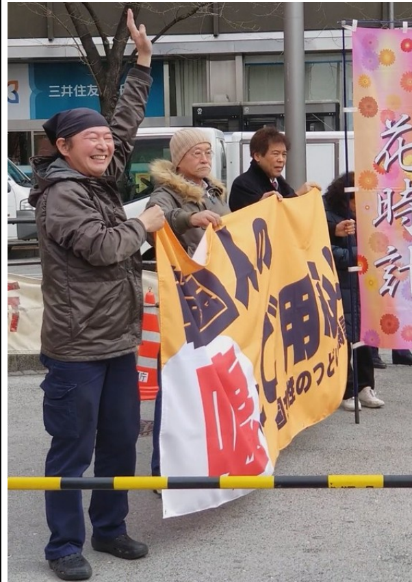
Figure 7: Male supporters.

Embassy. Every once in a while she laughed and teased the counter-demonstrators saying, “Is that all you can say - ‘go back home, go back home’? What we are saying is not hate speech.” Other times in between her monologue she admonished the counter-demonstrators for not acting like Japanese. “Do you call yourself Japanese? This is not how real Japanese behave. Are you sure that you are really Japanese?” The counter-demonstrators, some holding up the yellow placard “ heito supīchi o yurusanai ” (No hate Speech) distributed by the NoHate Nettowāku (Network) 25 and others waving self-made signboards, also had women in their 30s and 40s speak into a loud speaker. One of the main speakers who introduced herself and the others as “citizen-protest activists” apologized for the noise and then warned: “Everyone, please excuse the ruckus, but the women behind the large sign called ‘Flower Clock’ are spreading extremely poisonous hate speech.” It was a battle of words between women.