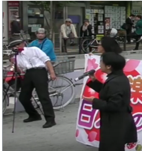
Figure 2: Male supporter recording a video.