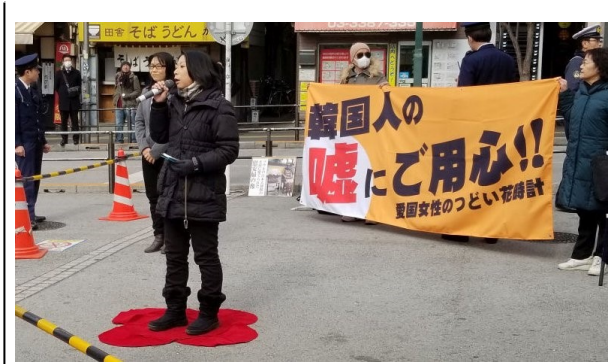
Figure 6: Hanadokei's signature banner.

On January 31, I observed Hanadokei's kick-off street oratory for the year 2019 at Nakano Ward in Tokyo. A handful of well-dressed, middle-class women varying in ages from mid 30s to 70s, took the lead taking turns on the microphone. Two women in their 20s wearing a pant-suit watched from the background as they took notes and periodically whispered with several men in business attire who were connected to the women's group. The men were alert in case trouble arose from counter-demonstrators. Other members held up the large bright orange sign with the phrase written in bold black, "Beware of Korean People's" and the Chinese character for "Lies" prominent in thick red against a white background (figure 6). The oratory began promptly at 12 noon, just in time for a big crowd crisscrossing the open space in front of JR station and the long shopping arcade near the intersection to buy lunch. There were about forty casually dressed counter-demonstrators, some wearing dark sunglasses, equipped with signs reading "Discrimination is unforgivable" or "Fuck discrimination" and many shouted and snarled into their small bull-horns, "Go back," "You idiots." One man with short cropped hair and dark sun-glasses held up a mid-sized mirror with a phrase "An embarrassment to Japan" to each of the speakers as they spoke. Periodically shrill sirens went off from the counter-demonstrators further drowning out