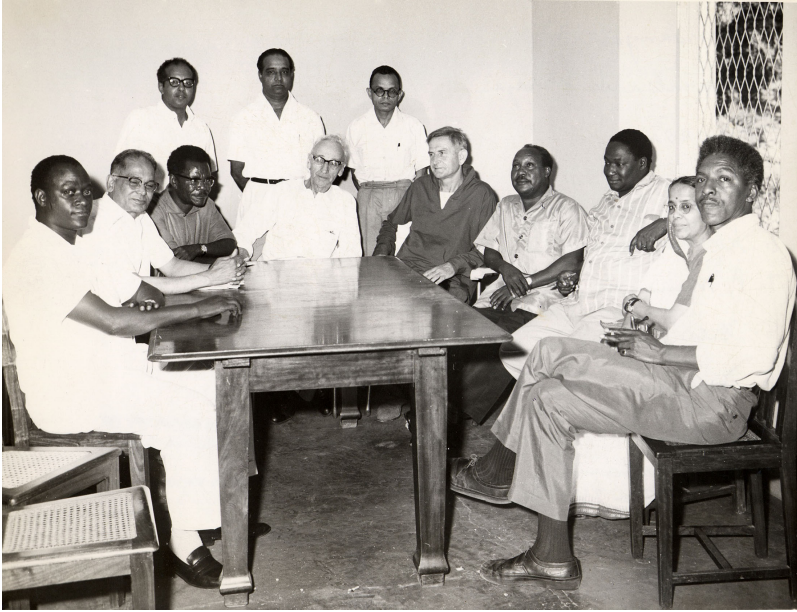
Figure 4. Muste (center) and Rustin (far right) with other members of the World Peace Brigade, a transnational effort to promote decolonization and nuclear disarmament by nonviolent means, in Tanganyika, Africa. Muste was co-chairman, along with Michael Scott of England and J. P. Narayan of India.

to challenge the dangerously bipolar world; and finally facilitating intraleft dialogue through various initiatives, most importantly, a new monthly, Liberation magazine.