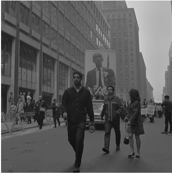
Figure 5. Antiwar activists honored Muste's memory at the April 15, 1967, demonstration organized by the Spring Mobilization to End the War in Vietnam.

Rights Movement and the American Establishment,” he criticized what he called the “problematic tie-in” between civil rights leaders and the Johnson administration. 30 Comparing the decision faced by the civil rights movement with that of the labor movement in the 1930s, he maintained, as he had then, that an alliance with the Democratic Party would make it complicit with American militarism and empire. Indeed, he suggested that civil rights leaders would do well to take the criticisms of Black nationalists seriously: “What people like Le Roi Jones [a.k.a. Amiri Baraka] are underlining,” he asserted, “is that Mississippi represents on a small scale what has obtained on a vast scale for several centuries in other parts of the world. In Asia and Africa white men have proclaimed and lived the doctrine of white supremacy and have humiliated the non-white peoples.” While he could not abide by Black-nationalist sentiments that advocated guerilla-style warfare or that seemed “not to regard white people as human beings,” he was firmly in their camp when it came to an assessment of “the role of the United States today,” which was “largely that of obstruction.” The civil rights movement “for Freedom Now has to be for liberation of subjugated and humiliated people everywhere, or carry a cancer in its own body,” Muste proclaimed. 31