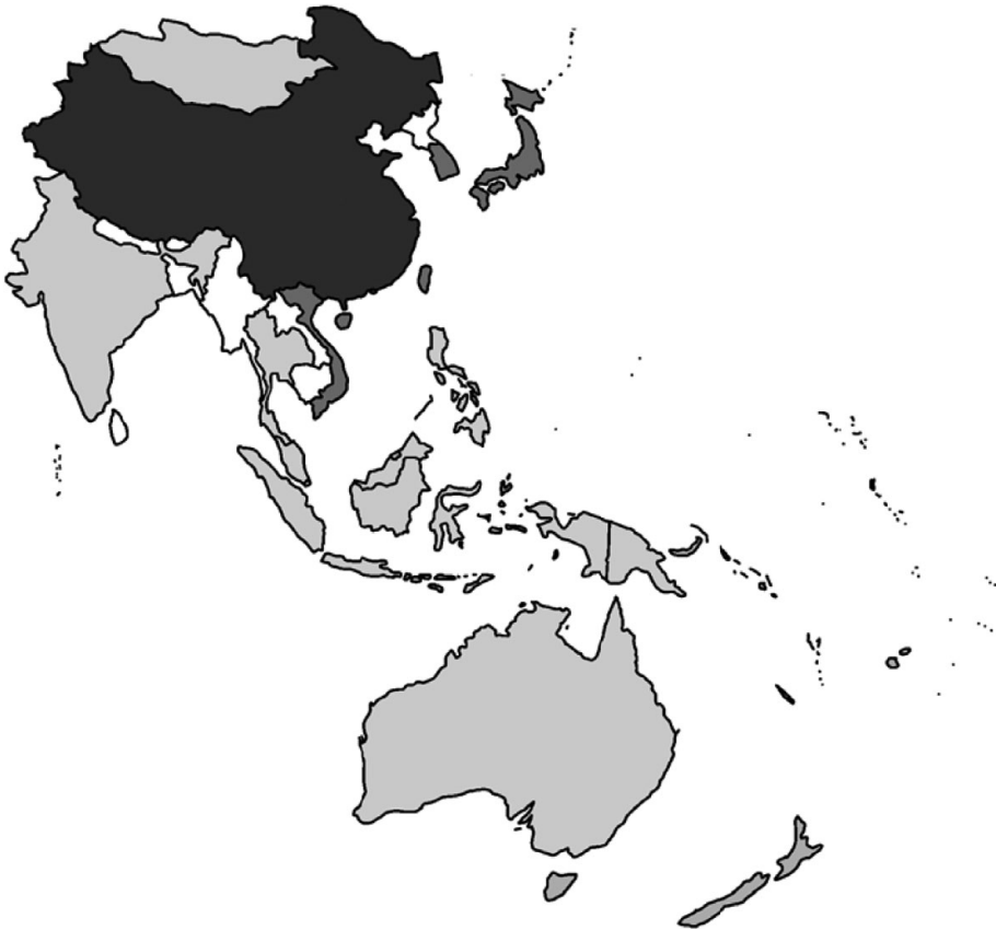
Figure 1. Countries, regions, and systems classifications

Notes: China (dark grey) and the Confucian world (grey) are sub-sets of the Asian countries for which we have data (light grey). White indicates no data.