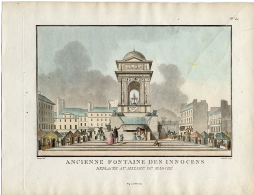
Figure 4: (Colour online) Durand and J. Janinet, Ancienne Fontaine des Innocens: Replacée au milieu du marché , 1807. Engraving, 24.5 × 32.3cm.

'the decoration of the city'. 71 For the crown, this presented an opportunity to demonstrate the regime's competence when its purported neglect of famous monuments provided a convenient proxy for attacking political misrule. In this respect, the new Fountain demonstrated the crown's custodianship over what had hitherto been a famous Paris rather than national monument. It was overseen and underwritten by the crown as part of its cultural programme to present the monarch as the custodian of the patrie who fostered, rather than personally embodied, national greatness and who collected and protected signs of France's illustrious past. Finding a solution for the Fountain reflected the crown's interests both in protecting certain historic monuments – at this time, it also contributed toward disengaging and restoring the Arènes in Nîmes – and in collecting French Renaissance artwork for the planned national museum. 72