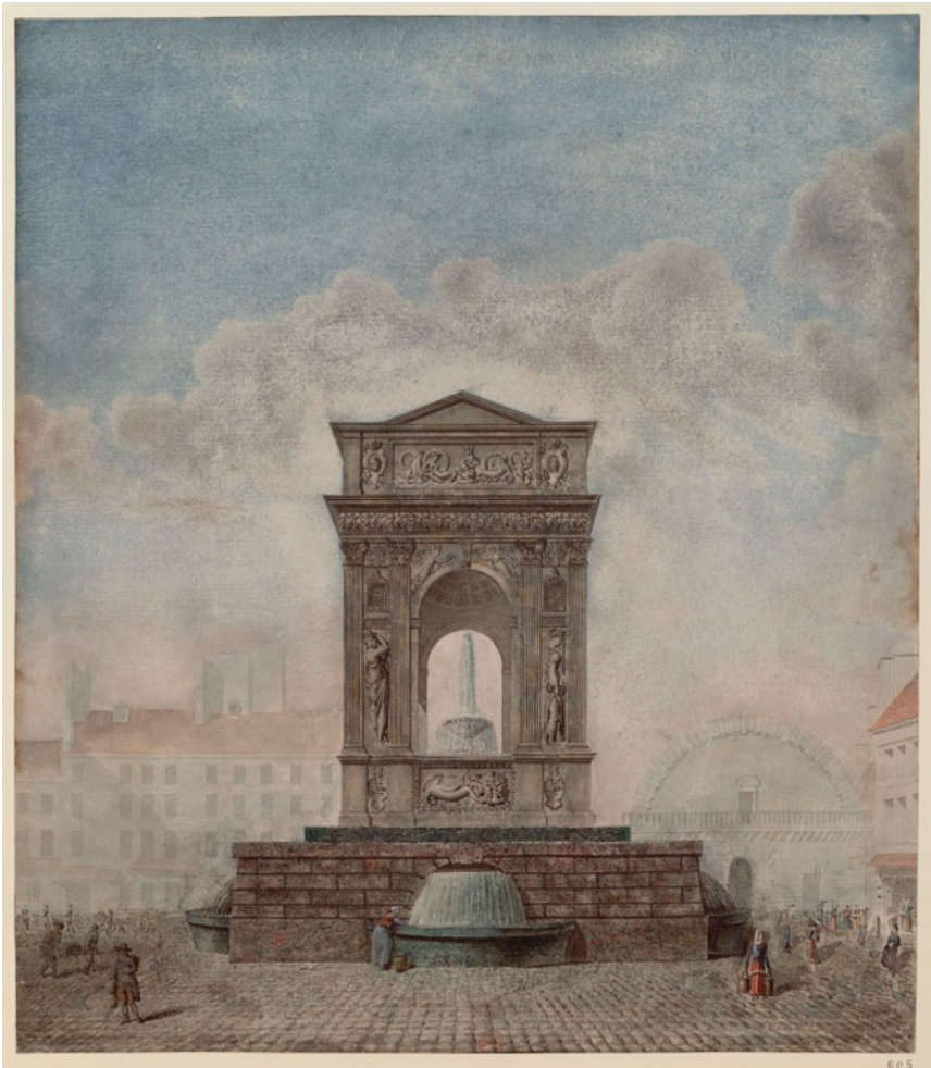
Figure 5: (Colour online) Jean-Nicholas Sobre (?), Projet pour la Fontaine des Innocents , c. 1787. Pen and ink drawing with ink wash and watercolour, 37.5 × 32.3cm. Reproduced with the permission of the Bibliothèque nationale de France.

cupola roof covered in fish-scale tiles. 76 In response to criticism of the original, Poyet also placed water at the centre of his design. The new design still provided water for drinking and cleaning. But, in keeping with expectations for public fountains, the new Fountain also used water for