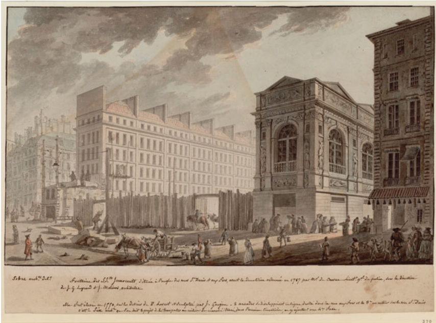
Figure 3: (Colour online) Jean-Nicolas Sobré, Fontaine des S.S.tts Innocents, située à l'angle des rues St Denis et aux Fers, avant la démolition ordonnée en 1787 par M. de Crosne, lieutenant général de police, sous la direction de J. G. Legrand et F. Molinos, architects, 1787 . Pen and ink drawing with light watercolour highlights and ink wash, 26 × 42.5cm. Reproduced with the permission of the Bibliothèque nationale de France.

paper maps, houses were not numbered and, until the 1730s, there were no signs for street names. 33 If few locals saw the Fountain through the rarefied language of art, they must nevertheless have recognized that it was uniquely ornate compared to recent austere fountains and that it was a rare secular public monument containing few allusions to the monarchy. Indeed, such was local pride in the Fountain as a popular landmark that, until 1791, the municipal government was untroubled by the prospect of stone or metal being pilfered. 34