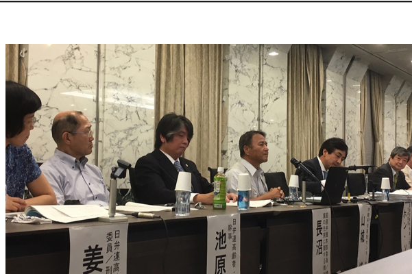
Japanese lawyers discussing the UN Principles on Arbitrary Detention at a symposium held at the headquarters of Japan's national bar association (Japan Federation of Bar Associations) on June 4, 2019.

United Nations bodies have repeatedly chastised Japan for its coercive police interrogations, insisting that the country should stop lengthy pretrial detentions, should allow attorneys to be present during interrogations and should take other steps to ensure that the presumption of innocence is respected. For example, in 2008 the United Nations Human Rights Committee wrote “The State party should adopt legislation prescribing strict time limits for the interrogation of suspects and sanctions for non-compliance, ensure the systematic use of video recording devices during the entire duration of interrogations and guarantee the right of all suspects to have counsel present during interrogations, with a view to preventing false confessions.” The Committee repeated these complaints in 2014. An entirely separate body, the UN Committee Against Torture has written that Japan’s practice of prolonged detention “coupled with insufficient procedural guarantees for the detention and interrogations of detainees, increases the possibilities of abuse of their rights, and may lead to a de facto failure to