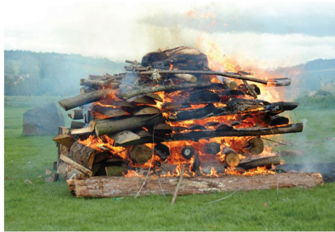
Figure 3 Cremating “Miss Piggy”

The cremation of a human body is, however, a complex process, more so than has been represented by our experiments on small joints of meat. Experiments of complete animal bodies, such as the one carried out by Sheridan (2003; Figure 3), should be conducted from an isotopic point of view in order to increase even more the current knowledge on isotopic exchanges occurring during cremation. The placement of the body on the pyre could potentially affect the differential uptake of endogenous versus fuel carbon. Those parts of the body closer to the pyre, for example, could be exposed to more fuel carbon, while those further away could be more affected by collagen carbon. At the same time, those parts that are further away from the flames are less likely to be fully calcined.