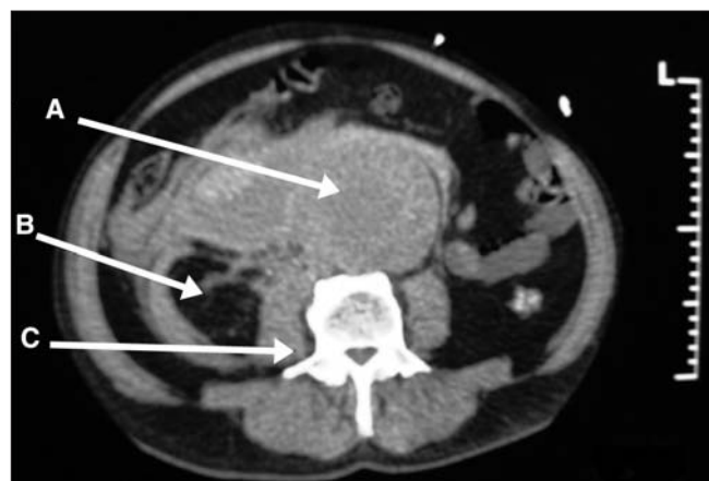
Fig. 1. A CT scan showing a large 9-cm infrarenal aortic aneurysm extensively leaking around the right kidney and psoas muscle. A = ruptured abdominal aortic aneurysm; B = right kidney; C = right psoas muscle surrounded by blood.

As to why a CT scan was chosen over a bedside ultrasound, the need to establish the presence of a leak was of far greater consequence than identifying the diameter of