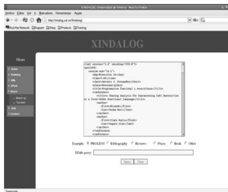
Fig. 3. Top-Down demo.

We have implemented two releases of the prototype: a top-down and bottom-up release (details about the later can be found in (Almendros-Jiménez et al. 2006)). In the Web site, there are some built-in examples which can be tested and new examples can also be typed.