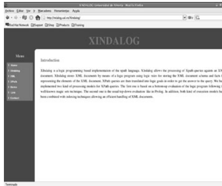
Fig. 2. http://indalog.ual.es/Xindalog .