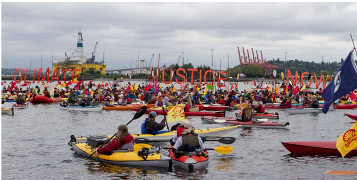
Figure 2 The “Paddle in Seattle”