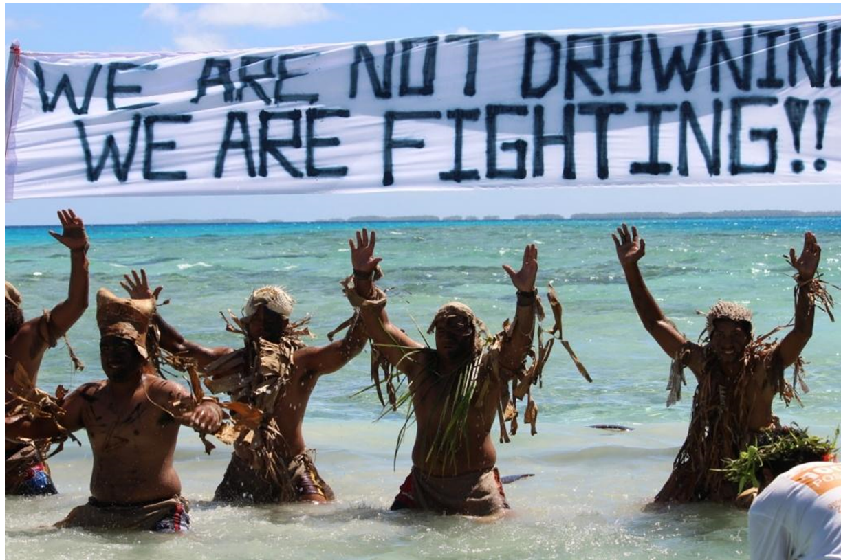
Figure 1 Pacific Climate Warriors