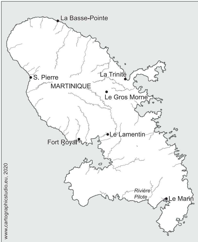
Figure 2. Map of Martinique and its main towns and villages, 1835.

The urban centres (the bourgs , large villages, and towns) of the French Antilles were dominated thus by the free population consisting of the white elite (comprising settlers, or colons , and creoles), poor whites, the mixed-races, foreigners, and black freemen and freewomen. 28 In Martinique before the abolition, the villes et bourgs counted around 23,800 free people and 8,200 slaves. In Guadeloupe and its dependencies, 19,500 free people and 10,000 slaves lived