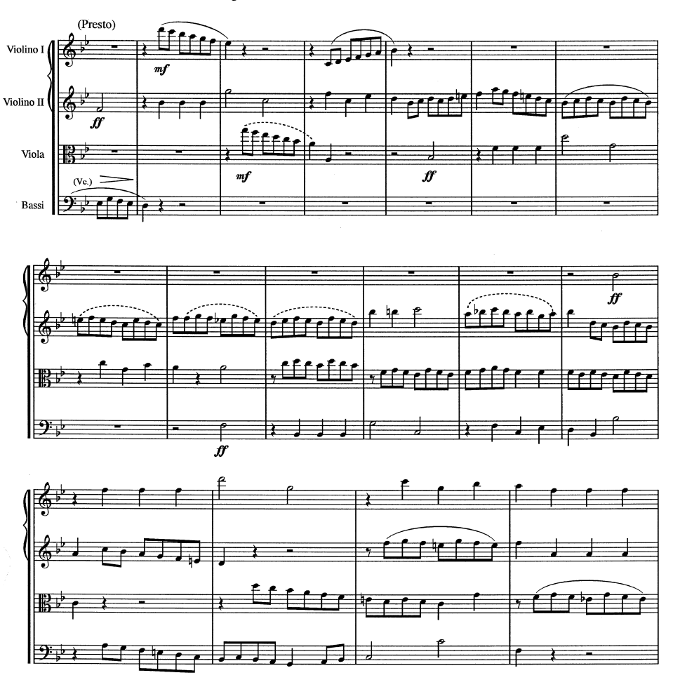
Example 6.1 Early 18<sup>th</sup>-century traits in Mendelssohn's sinfonias (a) Sinfonia 5, mvt. 3, mm. 24–40. Fugal imitation

(b) Sinfonia 4, mvt. 3, mm. 6-9. Chain of suspensions