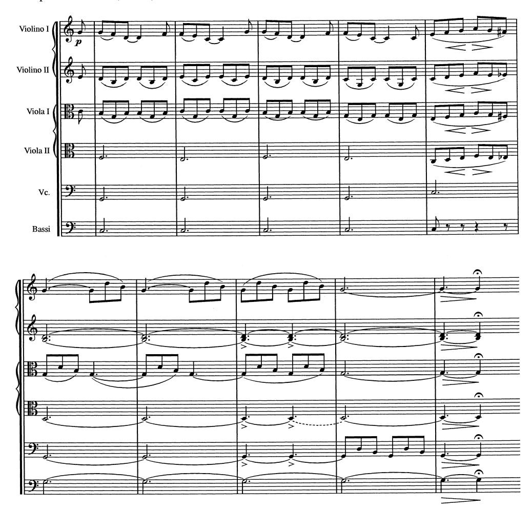
Example 6.2 Sinfonia 9, mvt. 3, mm. 41-50. Swiss folk tune

nocturne-like slow movements of Sinfonias 4 and 5. Notably, little of this music suggests any influence from Beethoven (although the principal theme of the first movement in Sinfonia 4 somewhat resembles the trio subject in the scherzo of Beethoven's Fifth Symphony). One clear foreshadowing of a distinctively Mendelssohnian device occurs in the minuet of Sinfonia 6. In the second trio comes the unexpected effect of a chorale-like (but apparently original) melody in whole-measure note values set against counter-melodic material in quarter and eighth notes (see Example 6.3). This anticipates the use of such texture in, for example, the "Reformation" and "Italian" symphonies and the second part of the orchestral opening of the Lobgesang .