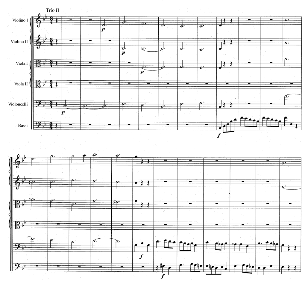
Example 6.3 Sinfonia 6, mvt. 3, mm. 60-83. Chorale-like style

movement of that same piece the violins play in four parts, the violas in two, and the cello and bass parts split, creating both high and low four-part string choirs and then, at the very end, eight parts. We have already noted that in the Scherzo of Sinfonia 11 percussion instruments join the strings. This tendency toward enriching and experimenting with scoring culminated in Sinfonia 8, which Mendelssohn composed first for strings but immediately re-scored for full orchestra.