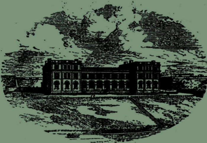
THE PLYMOUTH LABORATORY.