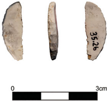
Figure 4. The single lunate from the site 35 assemblage.

general comparisons with the “flake-bladelet industries” of Pleistocene/Holocene Epigravettian tradition (Kaczanowska & Kozłowski 2014: 35). Moreover, some typo-technological similarities can be identified with the Final Pleistocene site of Ouriakos on Limnos,