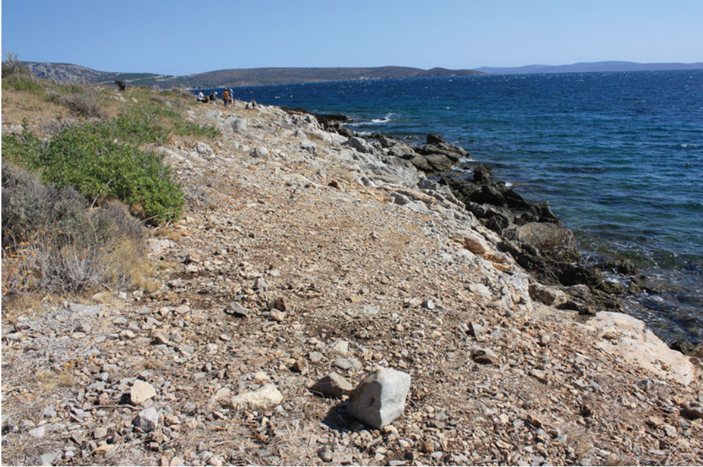
Figure 2. General view of site 35 from the south (photograph by Ç. Çilingiroğlu).