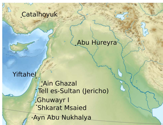
Figure 1 Sites mentioned in text. Modified from an original map by “Fulvio 314”, obtained from https://commons.wikimedia.org/wiki/File:Middle_East_topographic_map-blank_3000bc_crop.svg (last accessed 8th October 2016) under a Creative Commons Licence 3.0.

The pre-screening stage was followed by construction of site models concerned with events of interest to the current enquiry. The site models were built in a Bayesian framework outlined by Buck et al. (1996) and implemented in OxCal13 calibration Curve (Reimer et al. 2013).