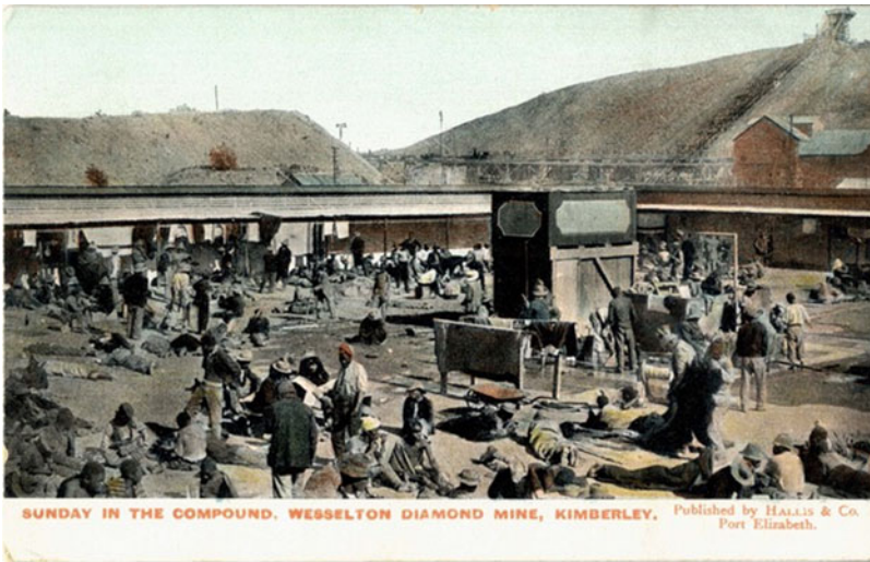
Figure 2. Postcard showing the compound of the Wesselton diamond mine in Kimberley, date unknown.

compounds (Figure 2). 110 She offers a brief discussion of the architecture, the salaries of the white managers and guards, the recruitment process, and the practice of the mining companies to set up stores inside the compounds. The argument that this took a profitable business away from Kimberley's merchants was the only protest uttered in the white community of Kimberley against the compounds. 111