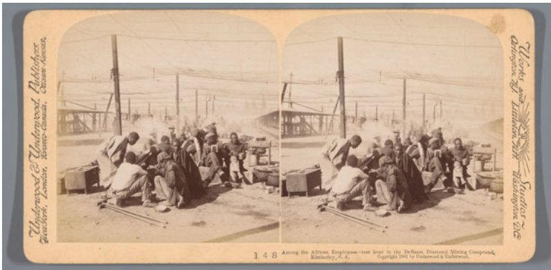
Figure 3. Stereograph by an anonymous photographer, 1901. The Dutch text reads: “Among the African Employees – rest hour in the De Beers Diamond Mining Compound, Kimberley, S.A.”.

Source: Rijksmuseum, Amsterdam, object number RP-F-F09042, public domain.