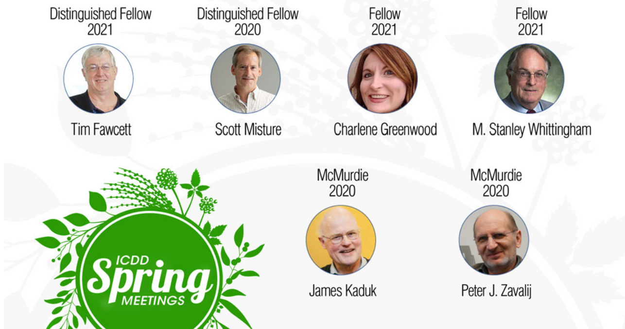
Figure 1. Esteemed recipients of the ICDD 2020 and 2021 Awards.

Director-at-Large, ICDD Board of Directors, serving the term 2020–2024.