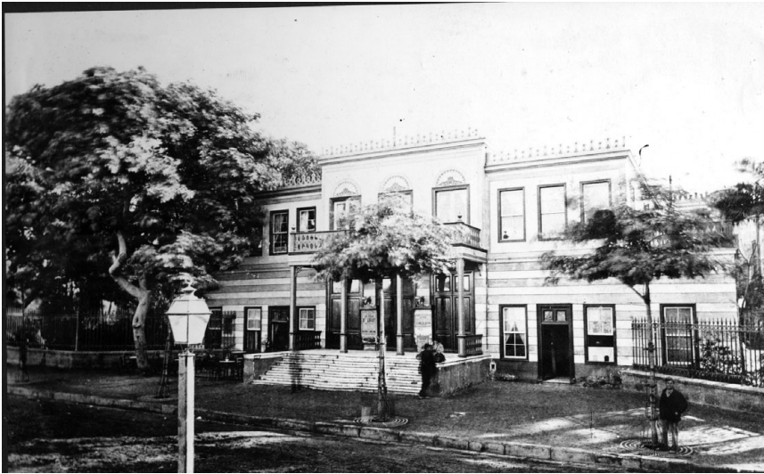
Figure 4: Comédie (E. Bécharde, 1874).

playhouses 104 with the exception of the Opera. 105 The music theatres were concentrated within a small territory on the south side of the Azbakiyya Garden. The first one, a Comédie, faced a police station ('Zaptiyye' ( Zabṭiyya )), which might have been instrumental in the direct supervision of pleasure. It was built by demolishing the ruins of Ahmed Tahir Pasha's palace. 106 The building itself had a curious look because it indeed resembled a palace. It contained '116 stalls, 46 orchestra stalls, 18 pit boxes, 18 first class boxes and 18 second-class boxes', with some screened boxes for the harem, 107 beautifully ornamented. 108 The inaugural performance by Manasse's French operetta troupe from Istanbul took place on 4 January 1869 (Figure 4).