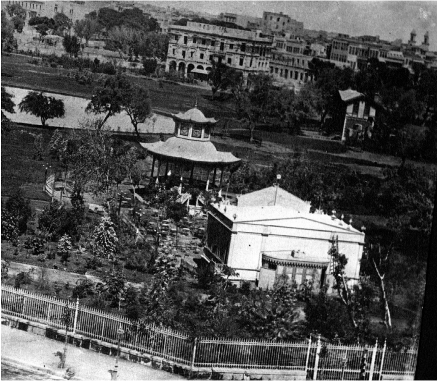
Figure 6: Théâtre-Concert du Jardin de l'Esbekieh, around 1872, unknown photographer (perhaps E. Béchard?). Collection Max Karkégi, with permission.

version of Arab modernity offered by Syrians represented a potential khedivial Arab façade for his heir, Tevfik, in the colonial atmosphere of the 1880s. In order to mark themselves as 'patriotic', Syrians allied with Egyptian singers, thereby forging a particular type of interregional music theatre in Arabic. The most successful such alliance was the collaboration between the Syrian impresario Sulayman Qardahi and the Egyptian singer Salama Hijazi, first in the spring of 1882, performing at the Opera House for the patriotic 'Urabi Pasha. After the British suppressed the 'Urabi-revolt, in the second half of the 1880s, Qardahi and Hijazi achieved enormous success together with the support of Khedive Tevfik. During these years, symbolically embodying the continuity of old and new Azbakiyya, the singer 'Abduh al-Hamuli also returned from private khedivial service to the public, with regular concerts at the Opera House. By attending these patriotic ( waṭani ) occasions, ordinary Egyptians, Syrians and the self-nationalizing Ottoman Egyptian elite often expressed political opposition