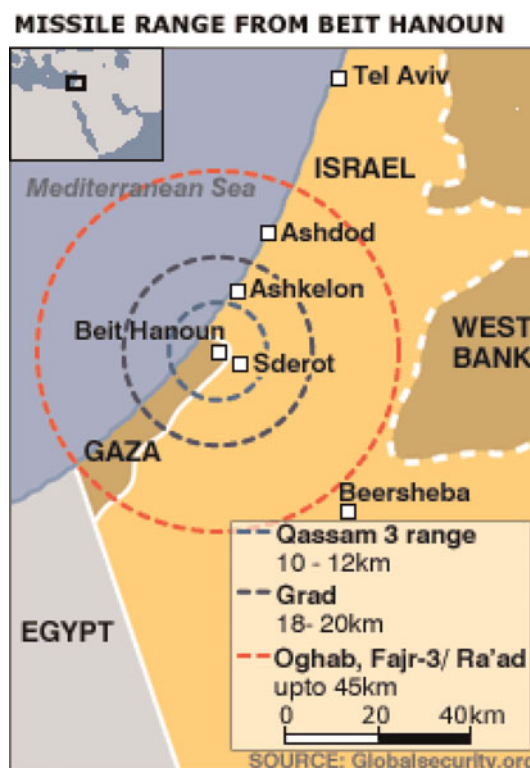
Figure 1. (Color online) A map depicting the Israeli town of Sderot in relation to the Gaza Strip. Citizens of Sderot, Israel, live within a 10-km range of missile attacks from the Gaza Strip and have 15 s from the sound of alarm to enter sheltered settings.

One hundred and forty-eight families comprised the war-exposed group. These included children living in the same neighborhoods in the town of Sderot, Israel, which is located