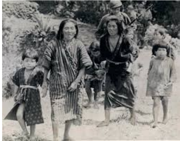
Civilian refugees in the Battle of Okinawa