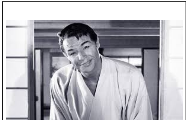
Marlon Brando as Okinawan interpreter in film of "Teahouse of the August Moon"

Teahouse of the August Moon , 25 in 1951, adapted in 1953 by John Patrick, 26 in 1956 for a Pulitzer Prize-winning Broadway play, 26 in 1956 for a film starring Marlon Brando in the role of the commander's Okinawan interpreter, 27 and in 1970 for a Broadway musical, "Lovely Ladies, Kind Gentlemen." 28 The Teahouse of the August Moon , in its four incarnations, is probably the best-known work of American literature set in Okinawa.