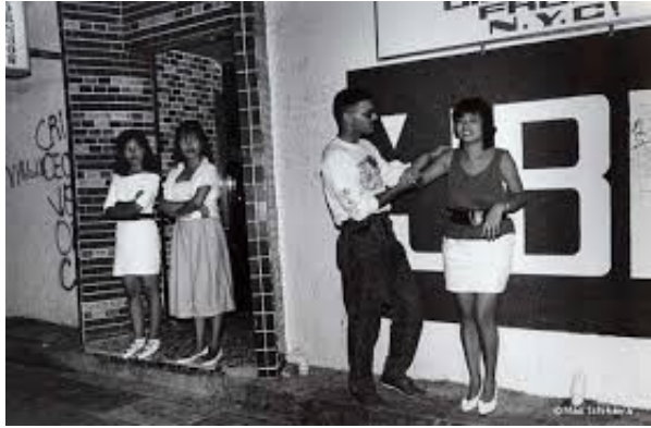
Koza, Okinawa, 1960s