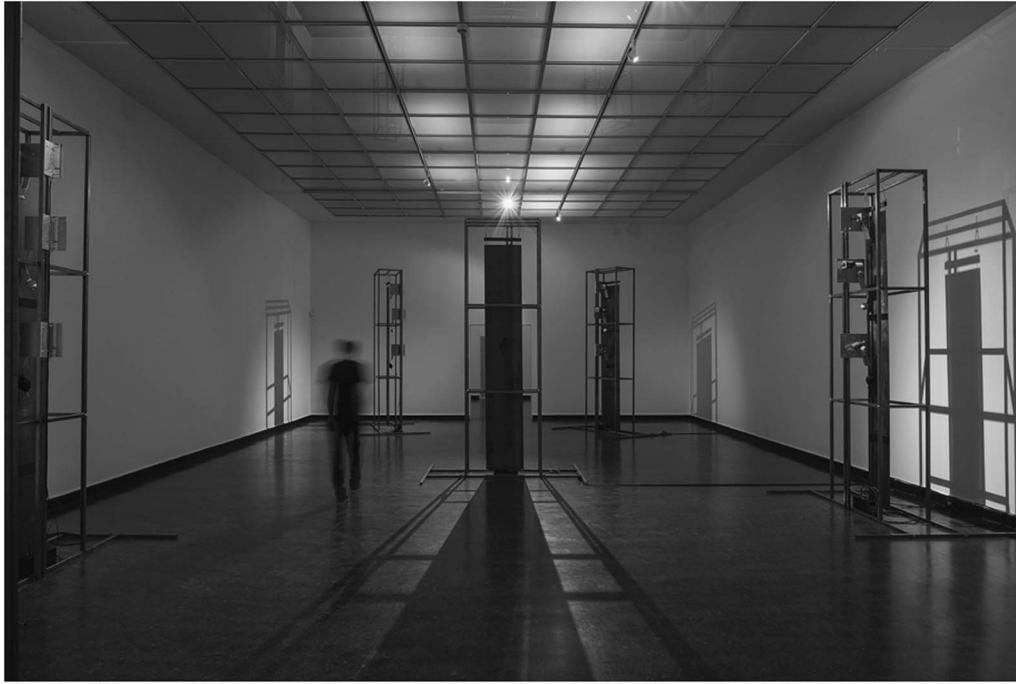
Figure 1. Doppelgänger consisted of several sound objects distributed throughout the exhibition space in Bergen Kunsthall.

to craft simulations of the timbres before starting to build the physical sound objects. These simulations can also be used as a tool for investigating the artistic possibilities of the kinetic sound objects.