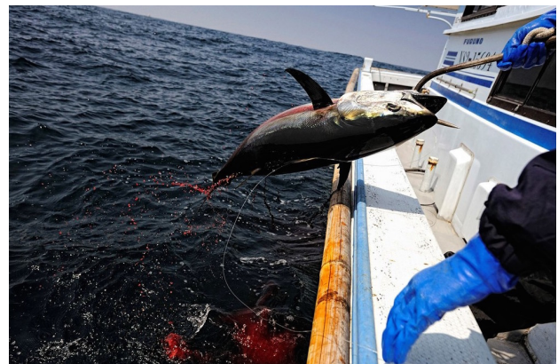
Nishi Kanji pulls out a bluefin tuna from the waters of Iki Island, Nagasaki

Catch data from Katsumoto, the main port on Iki Island in Nagasaki Prefecture, shows that while some 358 tons of Bluefin were unloaded there by the island’s 400 ippon-zuri (single rod and line) fishermen in 2005, they brought home just 23 tons in 2014.