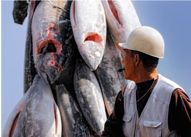
Frozen tuna are unloaded at Misaki port in Kanagawa Prefecture. Imports of Atlantic Bluefin from the Mediterranean peaked in 2006 at 22,600 tons. Six years later they had fallen about 64 percent to 8,200 tons.