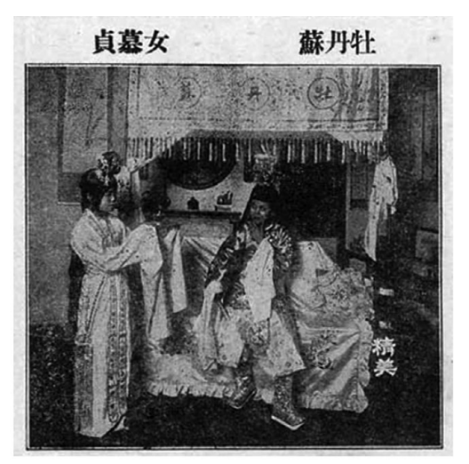
Figure 6 Figure 7