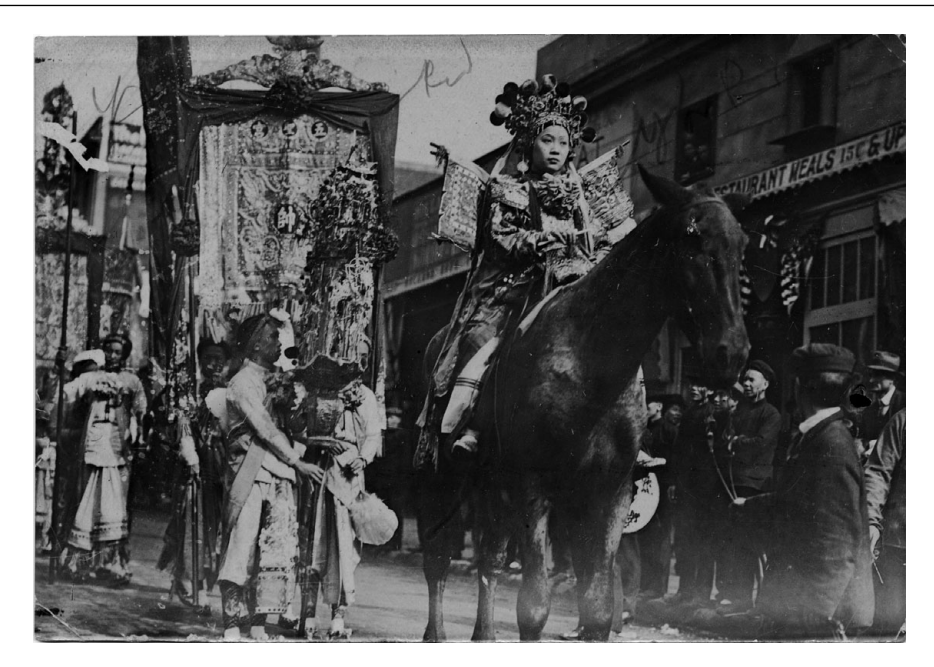
Figure 8. Fa Mu Lan in the Portola Parade of 1909.

while at the same time they assertively claimed the space Chinese Americans have long occupied in U.S. society. Such a public face reflected poignantly what Karen Shimakawa called the "seemingly contradictory, yet functionally essential, position of constituent element [of U.S. Americanness] and radical other." Chinatown theaters contributed significantly to the negotiation of this identity. The stellar opera performers, invaluable assets to the community, constituted an important representational agency and became an apt model for Chinese Americanness.