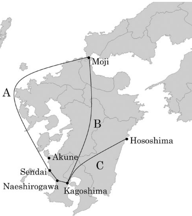
Figure 1. Three routes taken through Kyushu to Edo by Satsuma daimyo.

winds at sea. 34 However, as we will see, the opportunity to visit Naeshirogawa, to observe the ceramic industry there, and to receive displays of loyalty from its 'foreign' inhabitants, may also have been a factor in which highways they chose to take within their domain.