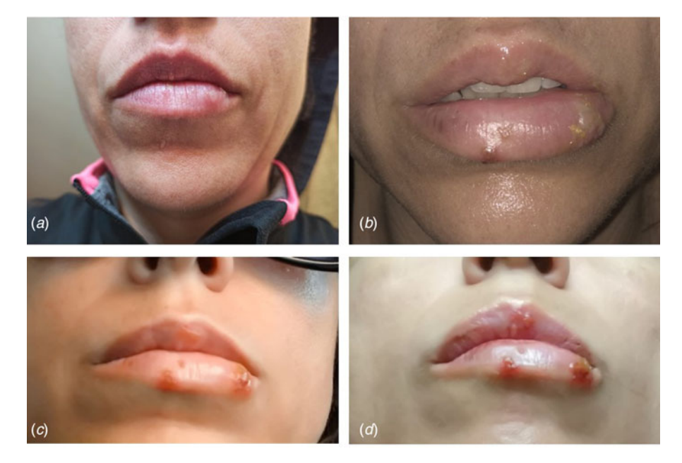
Fig. 2. Case 2. (A) Prodormal period with burning area and itching on the lower lip; (B and C) florid period of infection with increased number of vesicles on the lips and (D) referral period. Negative RT-PCR for SARS-CoV-2.

and decreased cardiac output with multi-organ damage [15, 17]. This altered immune response facilitates the replication of the virus and the increase in the viral load, by means of causing the NK cells and CD8+ lymph T cells to become exhausted and hence the coronavirus cannot be eliminated [18]. In the same way as occurs in other states of hyperactivation of the immune system, such as burn patients, polytraumatised patients and head trauma patients, the increase in adhesion molecules could generate a state of immunodeficiency of T and B lymphocytes which would remain attached to the endothelium of the blood vessels and therefore unable to enter the site where they should perform their function [19, 20]. In addition, the SARS-CoV-2 infection produces a reduction in the percentages of monocytes, eosinophils and basophils [2].