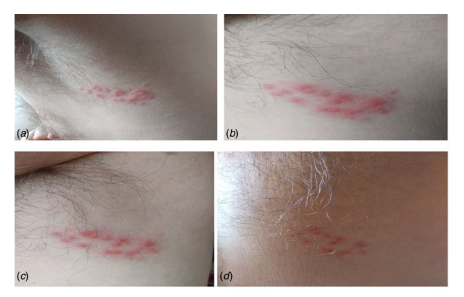
Fig. 1. Case 1. (A) Onset of lesions with raised vesicles over erythematous areas; (B and C) evolutionary periods with favourable remission of the herpetic infection and (D) advanced period of remission with vesicular drying and peeling of the skin. Negative RT-PCR for SARS-COV-2.