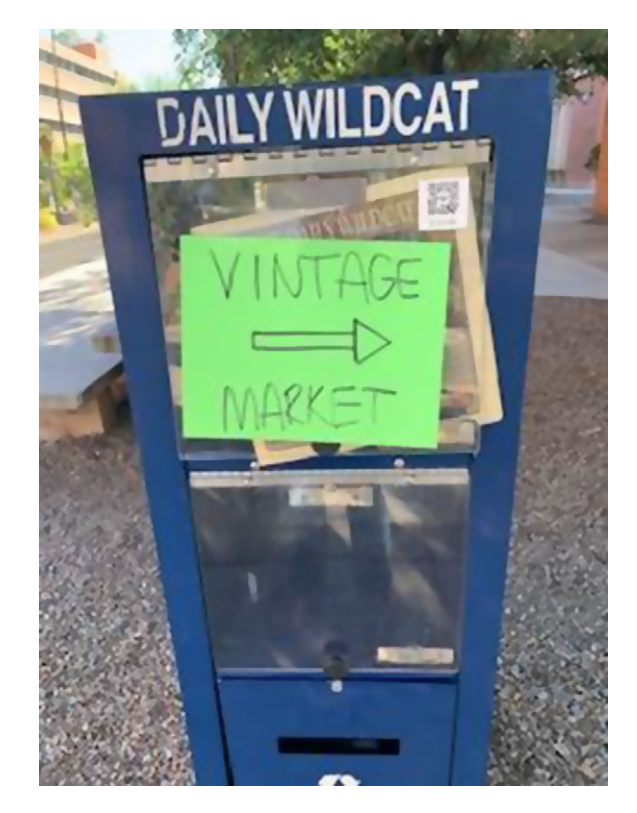
Figure 2. Vintage market pop-up sign on The University of Arizona campus.