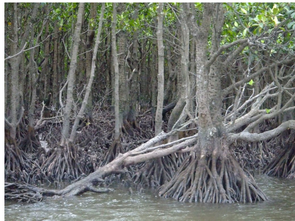
Mangroves on the Nakama River, Iriomote.

Shrugging his shoulders, Tarā stopped meddling. As his spirits dampened, to smooth things over, he reached over to the teapot and poured more tea into the cup he had just refilled so that it nearly overflowed.