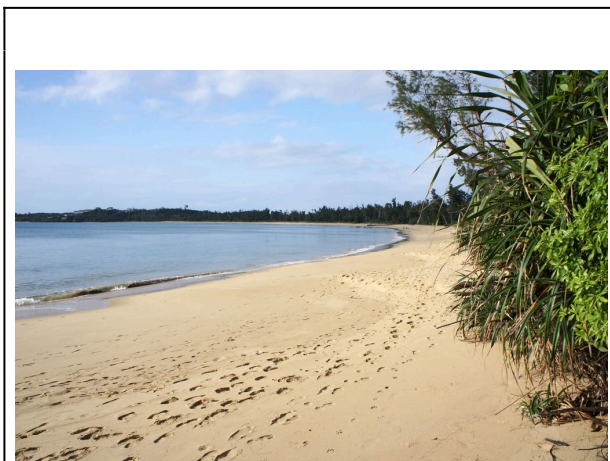
Tudumari-no-hama (Tsukigahama Beach).