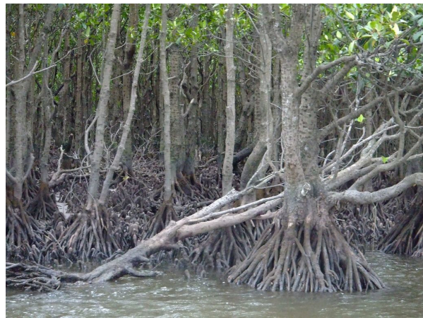
Mangroves on the Nakama River, Iriomote.

Shrugging his shoulders, Tarā stopped meddling. As his spirits dampened, to smooth things over, he reached over to the teapot and poured more tea into the cup he had just refilled so that it nearly overflowed.