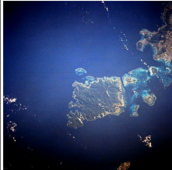
Iriomote Island from Space, 2005.