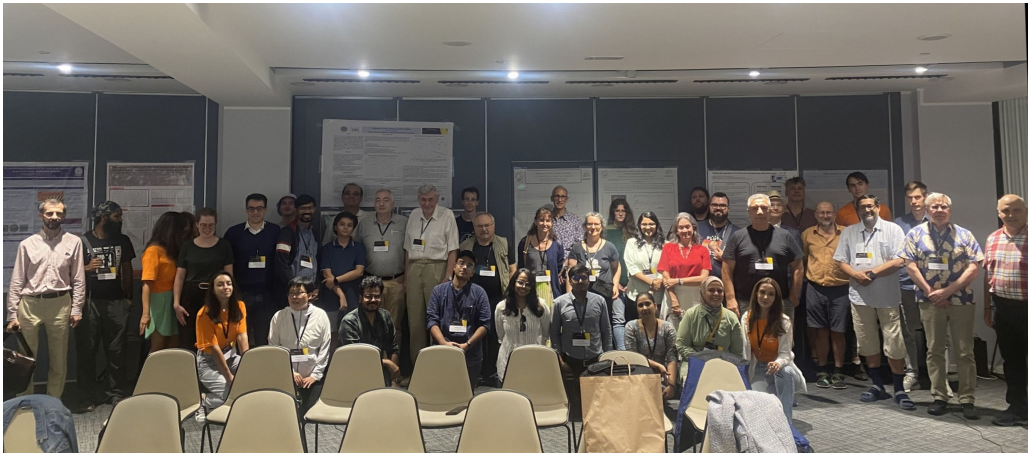
Figure 1. A group of participants after the closing ceremony.