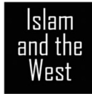
ISLAM AND THE WEST