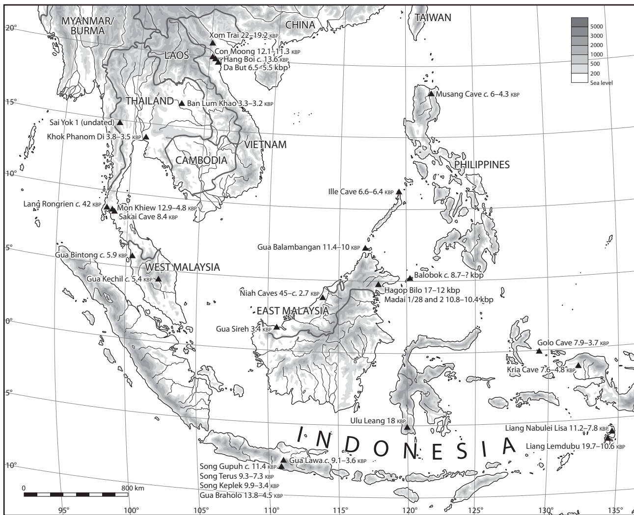
Figure 4. Southeast Asia showing a range of sites containing bone technology, and wherever possible the dates of the occupational sequence when such technology first appears. Most dates are presented calibrated. Occurrences commence in the Late Pleistocene, but are concentrated between the second half of the Last Termination and Holocene. The dates for Hagop Bilo, Madai 1/28, 2 and Balobok are uncalibrated values (see Bellwood 1984; 1988). (Illustration: R. Rabett & D. Kemp.)