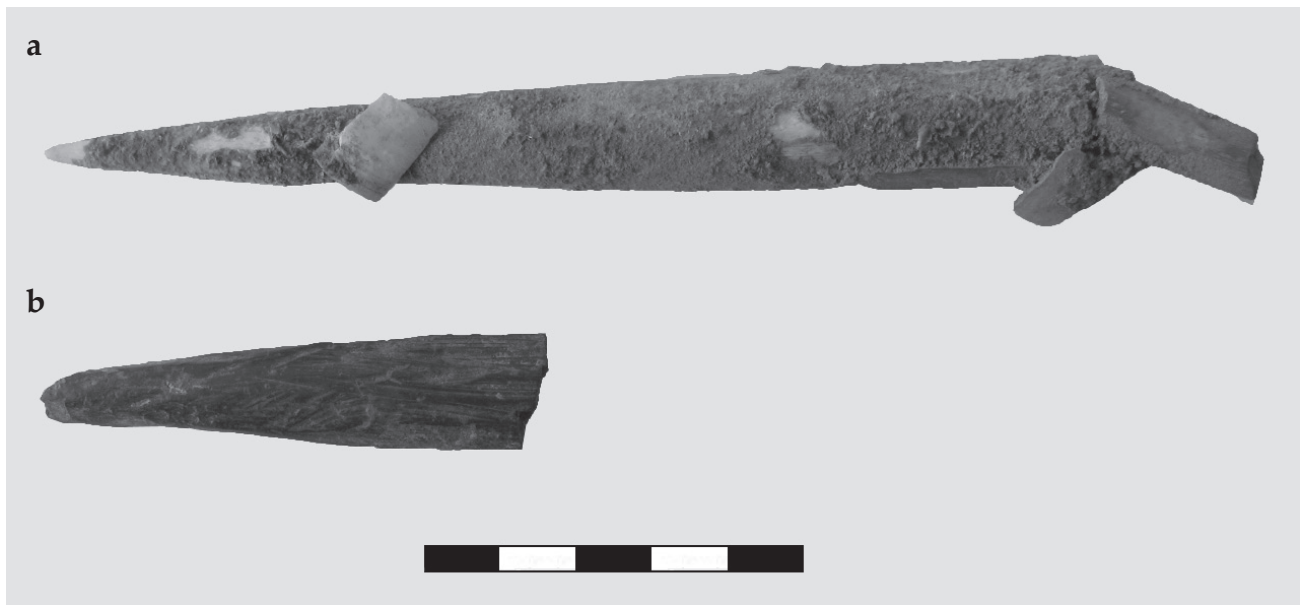
Figure 2. (a) Bone point from Hang Trông, geological context of probable Early Holocene age; (b) bone point from Hang Boi, context 5219, slightly younger than 13,601 \pm 43 cal. BP (UBA-14887). Both cave sites are in Trảng An park, Ninh Bình, Vietnam. Scale in 5 mm increments.