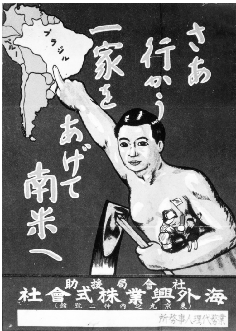
Figure 5.4 Kaikō poster from around the mid-1920s to recruit Japanese for Brazilian migration. It clearly illustrates two expectations on the migrants: (1) they were supposed to migrate in the unit of family; (2) with the hoe in hand, the central figure in the poster is a farmer. This indicates that migration should be agriculture centered.