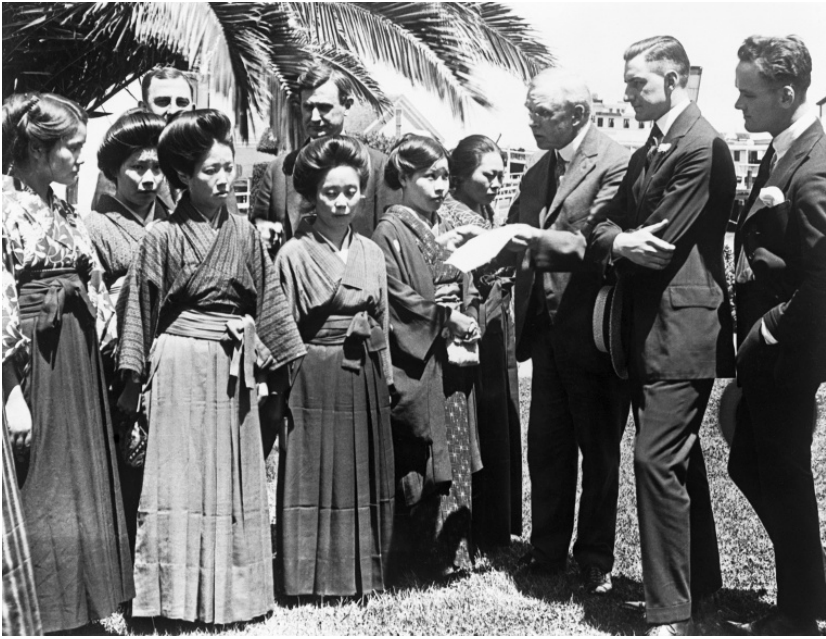
Figure 5.1 Members of an American congressional committee investigating the Japanese picture brides at the Angel Island immigration station. This photograph was taken on July 25, 1920.

correcting their manners in daily life but went as far as regulating their marriage and occupation. Owing to limitations of communication and understanding between the two sides before marriage, not all marriages of Japanese immigrants ended happily. In order to find a good partner, some Japanese male immigrants used fake pictures to appear younger and more handsome than they really were. Others lied about their financial situation, claiming that they were successful businessmen or rich landowners, while in reality they were merely agricultural laborers. 23 As a result, many picture brides felt either disappointed or cheated when they faced reality. Since there were far fewer women than men in Japanese communities in California, it was relatively easy for a single female to find a job and live by herself. Some