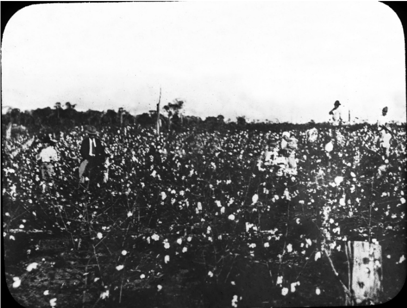
Figure 5.2 Japanese immigrants harvesting cotton in the field. This picture was used by Japanese Striving Society’s president Nagata Shigeshi for his speeches around Nagano prefecture in the late 1910s to promote Japanese migration to Brazil.

provided the Japanese immigrants with a sense of community. For example, the residents of Katsura Colony, the first settler community in Iguape, were able to communicate in Japanese in daily life, enjoy Japanese food such as rice and miso, and purchase Japanese goods at reasonable prices in local stores. 72 The Registro Colony, the second settler community in Iguape, founded in 1916, featured a medical clinic and its own brick and tile factories. Later on, both Katsura and Registro colonies also established schools. 73 In 1917, the Brazil Colonization Company started offering loans to every Japanese family – be they located in Japan or Brazil – that would come live in Registro. As a result, the number of new families who moved in grew from twenty in 1916 to one hundred fifty in 1918. 74