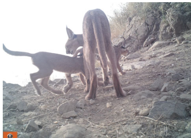
Mother and twin kittens of the Asiatic caracal Caracal caracal schmitzi captured by camera trap on 6 August 2023 in the Asir region of Saudi Arabia.

The caracal is categorized as Least Concern on the IUCN Red List, but is considered threatened or declining in