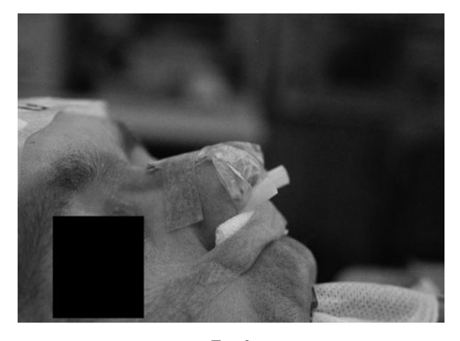
Fig. 3 The ends of the straws, above which lie the Netcell® packs and their strings taped to the dorsum of the nose.

From the Department of Otolaryngology, City Hospital, Birmingham, UK, and the *Department of Otolaryngology, Hirslanden Clinic. Zurich. Switzerland.