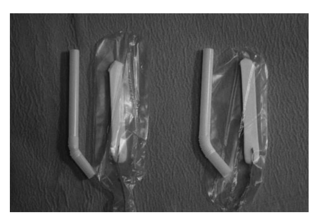
\label{eq:Fig.1} Fig.~1 The trimmed straws along with the wrapped Netcell ^{\circledR} packs.