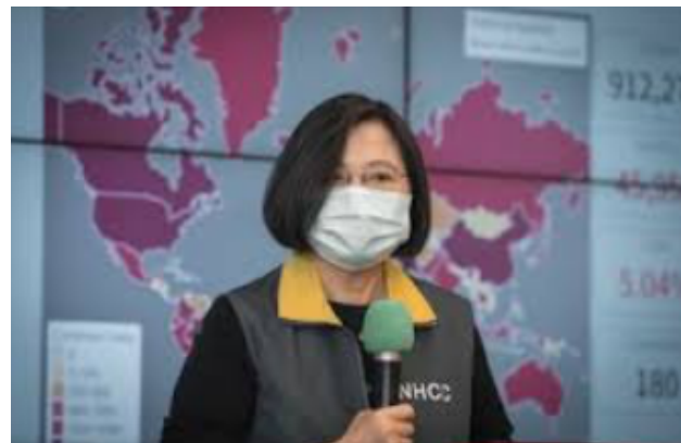
Taiwan President Tsai Ing-wen

Even the reliably pro-LDP Sankei recorded a 25 percent increase in public disapproval of Abe's crisis management between the end of March and mid-April, with sixty-four percent faulting Abe's handling of the virus outbreak. In declaring a limited state of emergency on April 7 Abe acknowledged the healthcare crisis, one that is a result in part of his unwarranted complacency about the pandemic. His complacency set the tone for the government's tardy crisis response, leaving Japan the laggard in East Asia. Compared to resolute regional leaders in Taiwan, South Korea, Singapore and Vietnam, Abe dithered and failed the COVID-19 leadership stress test.