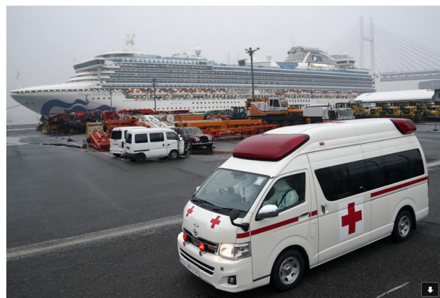
Ambulance in front of the Diamond

Thus, it is too soon to know the scale of the outbreak and the number of deaths due to COVID-19, but current figures are most likely underreporting the actual toll.