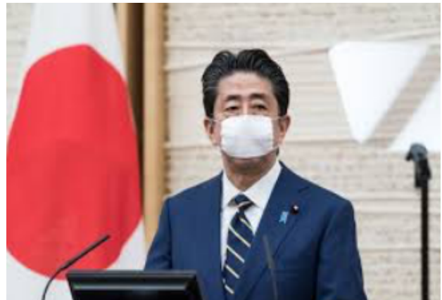
PM Abe declares National Emergency

Other fumbling world leaders are grateful for these relentless Trumpian blunders because he makes everyone look better, even dolts like President Bolsonaro of Brazil. But the disaster of Trump doesn't mean that we shouldn't scrutinize other leader's failings. A case in point is Japan's slow-motion train wreck.