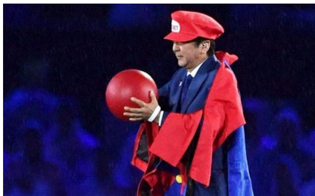
Abe as Super Mario at Rio 2016 Olympics closing ceremony

Keidanren appeared to have written the first draft of Abe's stimulus package and will play a crucial role in both mitigating the economic dislocation and in the timing of the exit from Japan's version of lockdown. In consultation with the Japanese Trade Union Federation (Rengo) and the government, Keidanren is encouraging member companies to maintain jobs by all possible means. Keidanren represents large enterprises, employing about 30 percent of the workforce, and they have vaults of cash that should help them ride out the pandemic. The situation is not so rosy for small and medium size firms where 70 percent of Japanese work . The government anticipates that the pandemic impact on unemployment may prove severe as shrinking demand at home and overseas will batter the economy. Suicide is a grim leading indicator of the misery index and is tragically on the rise .