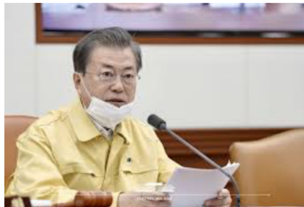
President Moon Jae-in's party won a landslide victory in April 2020

Clearly, President Moon has managed the outbreak much better than Abe and voters rewarded him in the recent parliamentary polls .