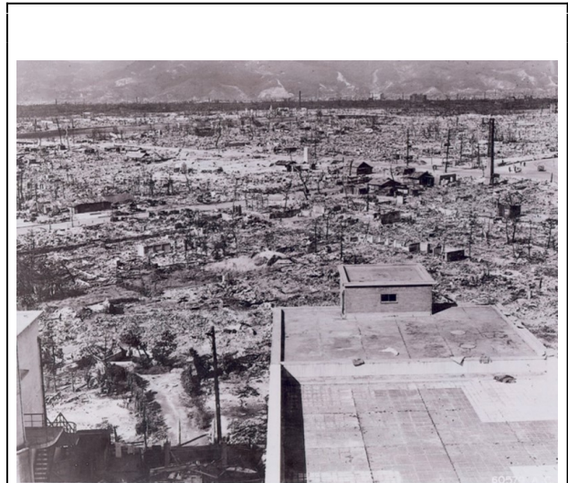
Hiroshima after the bomb. The view from the ground.

the ravages associated with radiation. 26 Finally, not only was the press tightly censored on atomic issues, but literature and the arts were also subject to rigorous control prior.