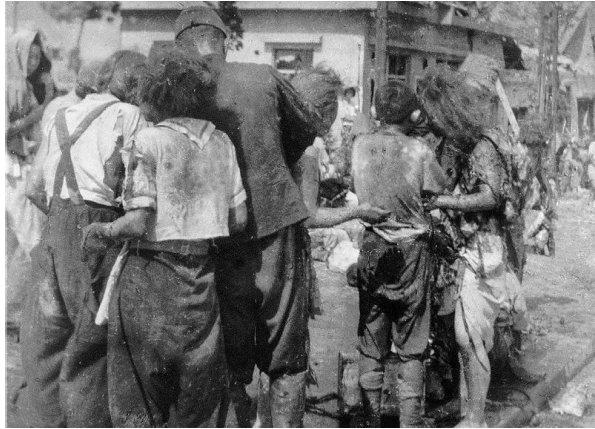
Atomic Bomb survivors at Miyuki Bridge, Hiroshima, two kilometers from Ground Zero. Aug. 6, 1945. Under US censorship, Matsushige's photos could not be published until 1952 following the end of the occupation.

The US would celebrate the power of the bomb in powerful visual statements of the birth of the nuclear era that would be directed at the entire world on August 6, on August 9 and in the decades that followed, both in officially controlled photographic images and in privileged reportage, notably that of New York Times science reporter William R. Laurence. What was banned under the occupation were close-up images of victims whether of the firebombing or the atomic bombing captured on film by Japanese photographers, that is, the human face of the atomic holocaust that was captured on film in iconic photographs of Hiroshima, Nagasaki and Tokyo by Japanese photographers.