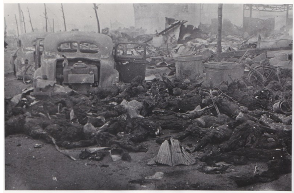
Bodies of people trapped and burned as they fled through a street during the attack on Tokyo on the night of March 9-10.