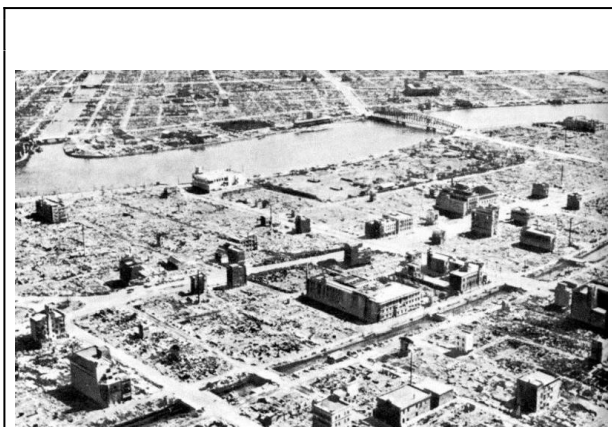
Aerial photo of Tokyo after the bombing of March 9-10.

The chief characteristic of the conflagration . . . was the presence of a fire front, an extended wall of fire moving to leeward, preceded by a mass of pre-heated, turbid, burning vapors . . . . The 28-mile-per-hour wind, measured a mile from the fire, increased to an estimated 55 miles at the perimeter, and probably more within. An extended fire swept over 15 square miles in 6 hours . . . . The area of the fire was nearly 100 percent burned; no structure or its contents escaped damage.