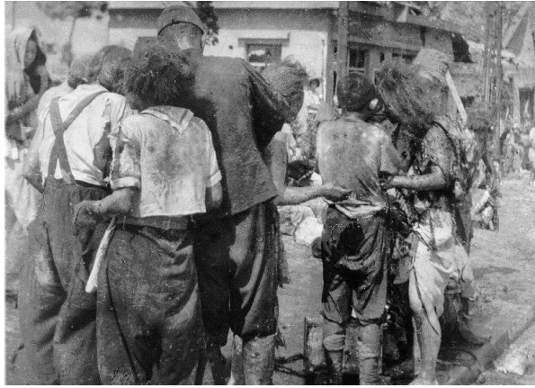
Atomic Bomb survivors at Miyuki Bridge, Hiroshima, two kilometers from Ground Zero. Aug. 6, 1945. Photo by Matsushige Yoshito. Under US censorship, Matsushige's photos could not be published until 1952 following the end of the occupation.