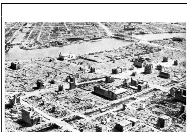
Aerial photo of Tokyo after the bombing of March 9-10.

The chief characteristic of the conflagration . . . was the presence of a fire front, an extended wall of fire moving to leeward, preceded by a mass of pre-heated, turbid, burning vapors . . . . The 28-mile-per-hour wind, measured a mile from the fire, increased to an estimated 55 miles at the perimeter, and probably more within. An extended fire swept over 15 square miles in 6 hours . . . . The area of the fire was nearly 100 percent burned; no structure or its contents escaped damage.