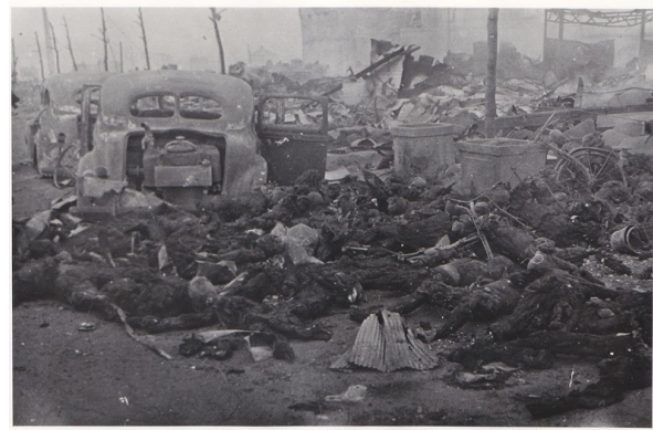
Bodies of people trapped and burned as they fled through a street during the attack on Tokyo on the night of March 9-10.