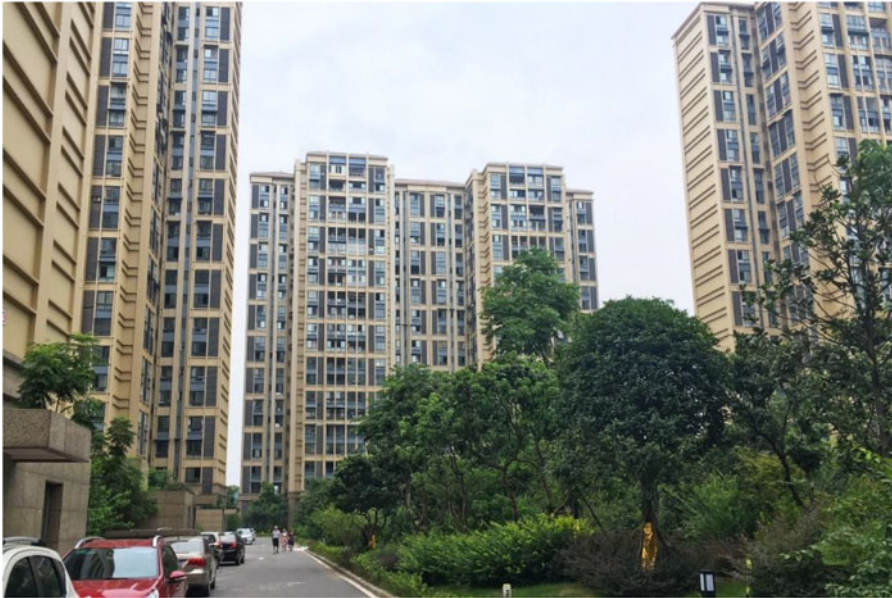
Figure 3. Buildings within the Resettlement Neighbourhood.