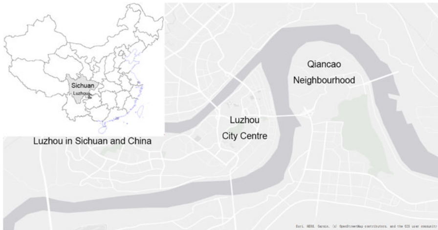
Figure 1. The Location of Qiancao.