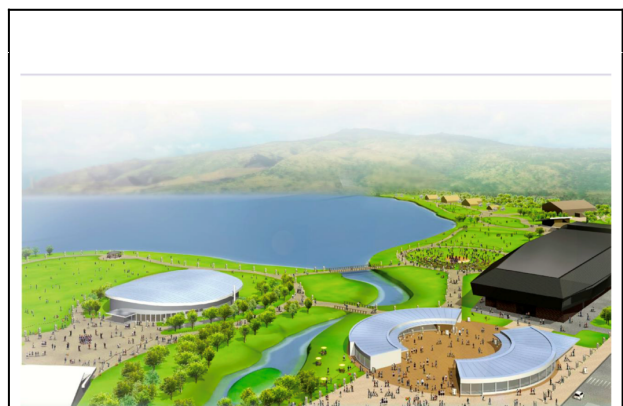
Design for the Symbolic Space for Ethnic

The main negative aspect of the complex deliberation process, on the other hand, was the fact that it failed to create a meaningful way of listening to and incorporating the concerns of the Ainu community at large (a point to which I shall return shortly). Between 2011 and 2012 a Working Group on the Symbolic Space for Ethnic Harmony produced an outline plan for the Space, and this was then further reworked and refined by sub-committees and by government officials, culminating in a revised and more detailed master plan and architectural design which was adopted by the Council in 2016. 17 The Space is to be constructed on the site of the former Ainu Museum at Poroto Kotan, near Shiraoi (which was created in the 1960s and closed in March 2018). It will consist of three elements: a National Ainu Museum [ Kokuritsu Ainu Minzoku Hakubutsukan ], a National Ethnic Harmony Park [ Kokuritsu Minzoku Kyōsei Kōen ] and a Resting Place [ Irei Shisetsu ] for the remains of the dead (discussed further below), and will be opened in April 2020 - in other words, as reports on the project repeatedly stress, just in time for the 2020 Tokyo Olympics.