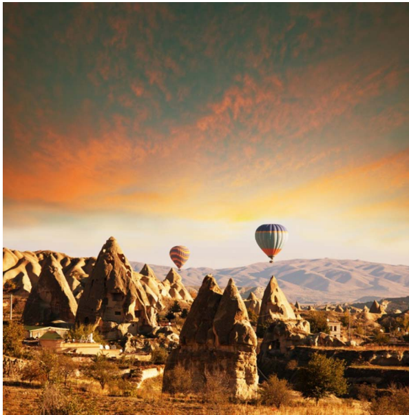
Figure 5. Cappadocia.