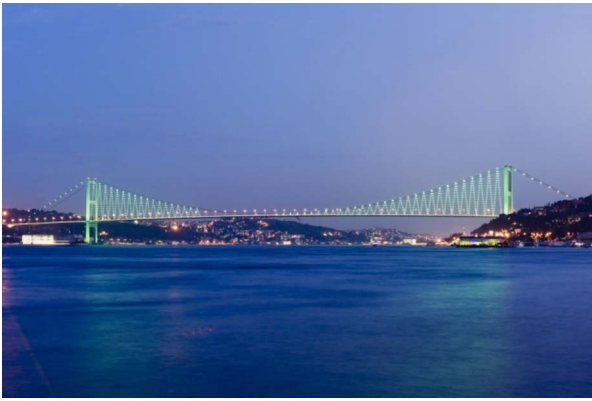
Figure 1. The Bosphorus bridge connecting Europe and Asia.