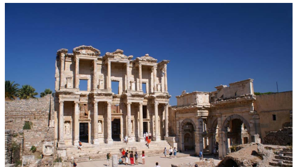
Figure 4. Ephesus.

bid presentation video, highlighting the beauty of Istanbul, you can find it on the homepage at the following internet address: http://wcpccs2017.org/en/