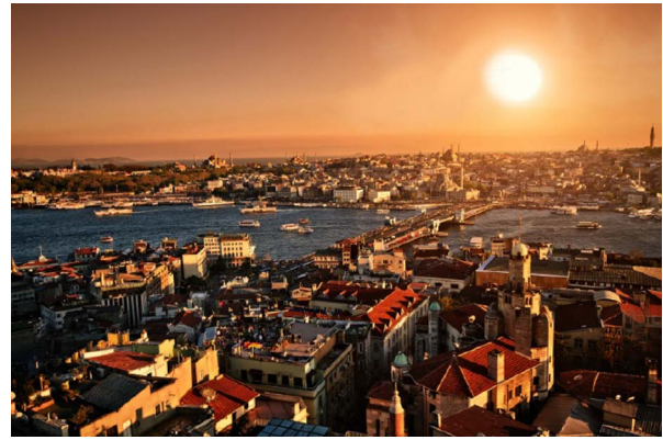
Figure 3. Istanbul view.