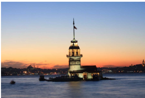
Figure 6. Maiden Tower and historical peninsula behind Istanbul.

Europe from Asia and connecting the Black Sea to the Mediterranean basin.