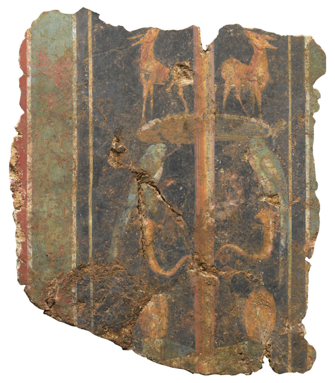
FIG. 23. 21 Lime Street, London. A section of a decorative fresco dating to the first century A.D.

(11) 15–16 Minories, 62 Aldgate High Street, EC3 (TQ 33695 81135): a single Roman soil deposit possibly representing a pit or quarry fill was recorded in one of the boreholes. The site lies within the Eastern Cemetery of Roman London but no burials were seen during this phase of work.<sup>200</sup>