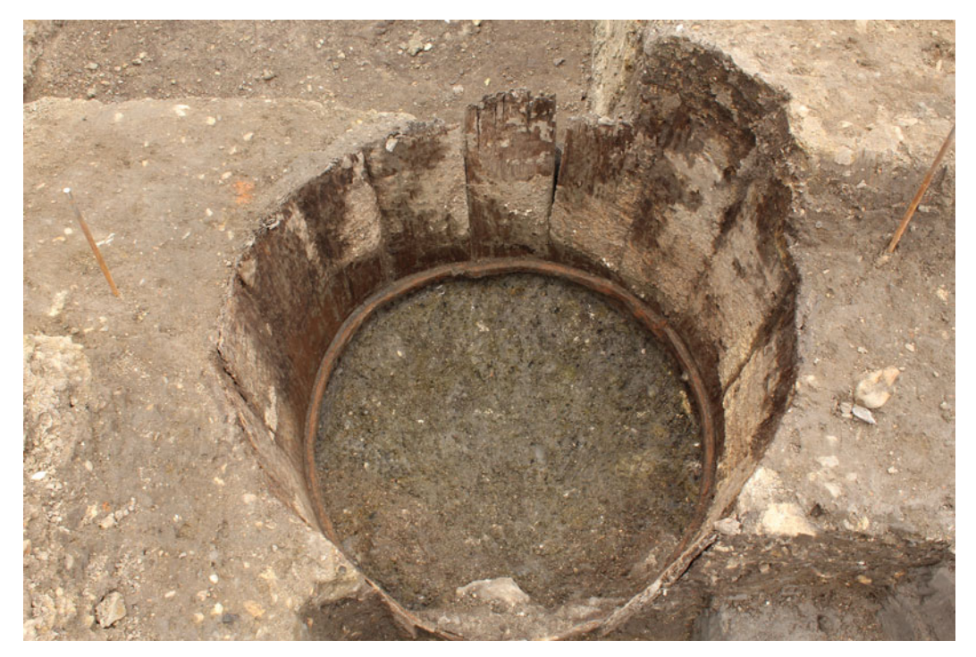
FIG. 26. Brandon House, Southwark. Barrel well.

south-east, and may indicate the presence of small-scale industry. Features south of the early Roman revetment included drainage ditches, the remnants of a timber box-drain, a number of possible wells and a timber barrel well (FIG. 26), from which a small dark stone oval intaglio with a horse and rider motif was recovered.<sup>216</sup>