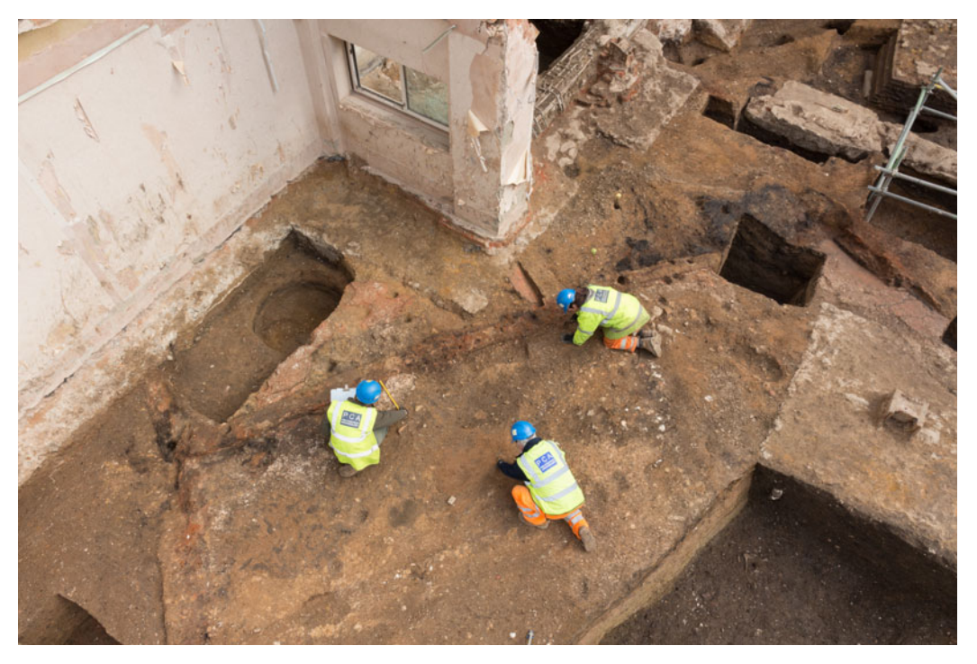
FIG. 22. Fenchurch Street. Timber and clay building, showing outline and remnant of partition wall, remnants of tessellated floor, and a small section of surviving upright plaster.

(6) 17 Devonshire Square EC2 (TQ 33337 81518): monitoring of geotechnical trial-pits revealed a layer of possible Roman date containing a single sherd of pottery and fragments of opus signinum in one trial-pit but it is likely that the majority of the Roman stratigraphy on the site has been removed by medieval and later activity.<sup>194</sup>