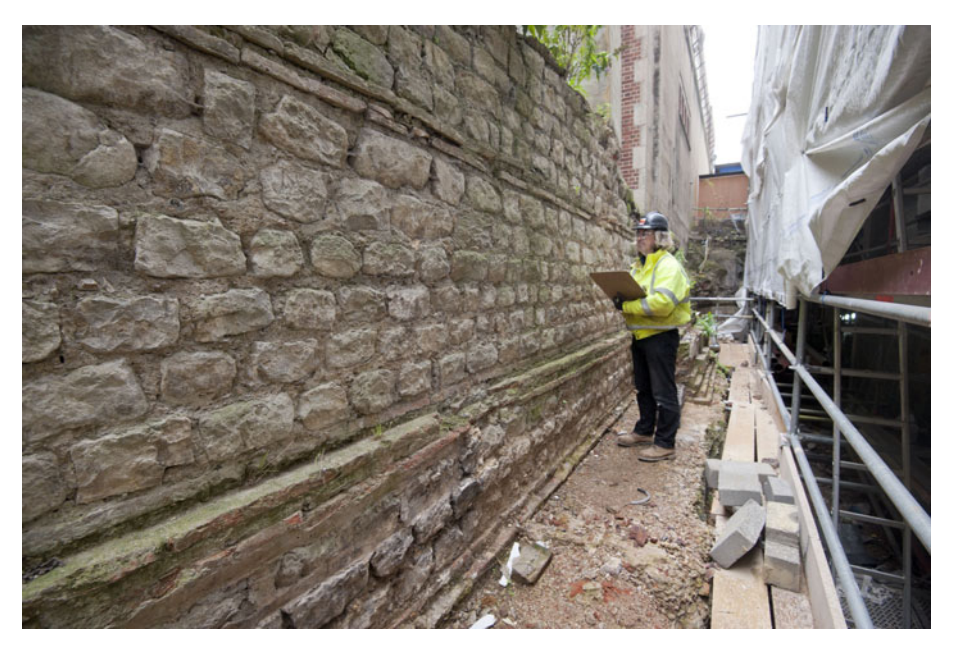
FIG. 27. View along the west (internal) face of the surviving London City Wall at the rear of 38–40 Trinity Square, looking south.

the fabric were three continuous courses of tiles, most being red while a few were pale green/ yellow. The coursing from the base upwards as recorded (the wall base was not revealed) was thus: 2 stone courses -3 tile courses -6 stone courses -2 tile courses -5 stone courses - the truncated remnants of 2 tile courses. The results of the survey have been integrated with those of previous work to produce a single west-facing elevation of the wall in this area.<sup>218</sup>