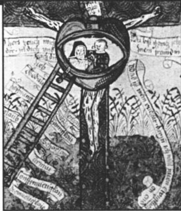
From Nuns as Artists

An Ahmanson Murphy Fine Arts Book, $55.00 cloth, illustrated