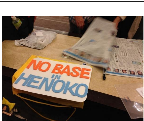
No! As of 2021 the anti-Henoko base

Reflecting on the experience of the group, I wondered what it means to Okinawans to live so close to the US military and how many “history-turning moments” must occur before US-Japan military forces eventually leave the islands. I recognized, too, that the struggle over the Henoko base also created divisions within communities and families, particularly those whose livelihood depended on servicing the bases. A brief tour highlighting the “Okinawan fight” can only capture a snapshot of the larger struggle of mobilization against militarism.