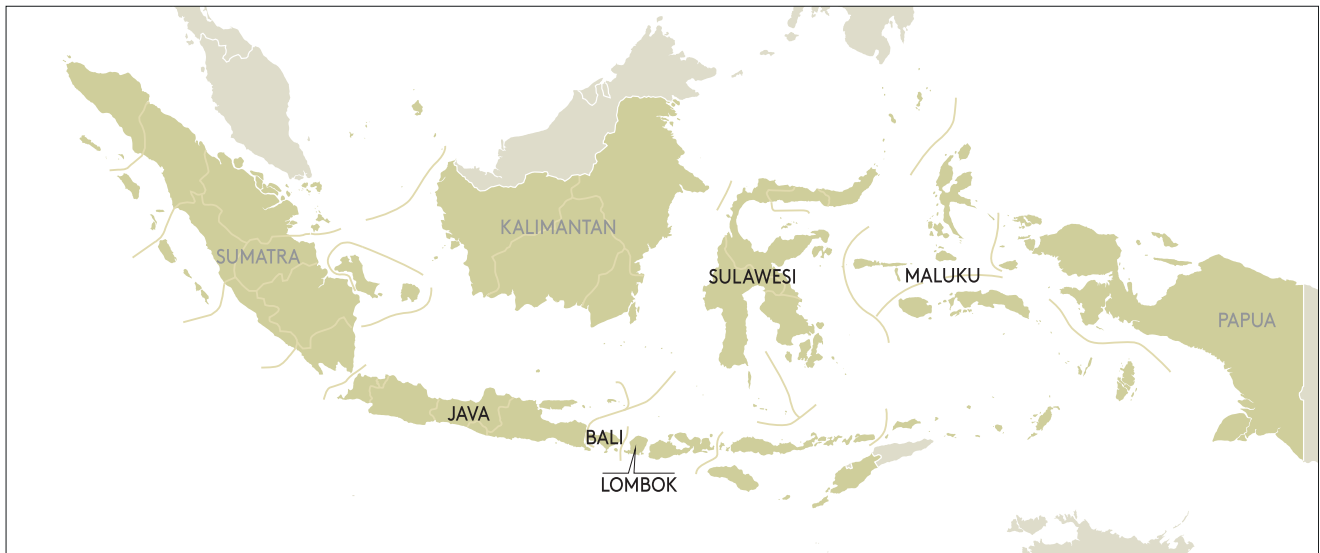
Figure 1. Locations of the initiatives examined in the research.