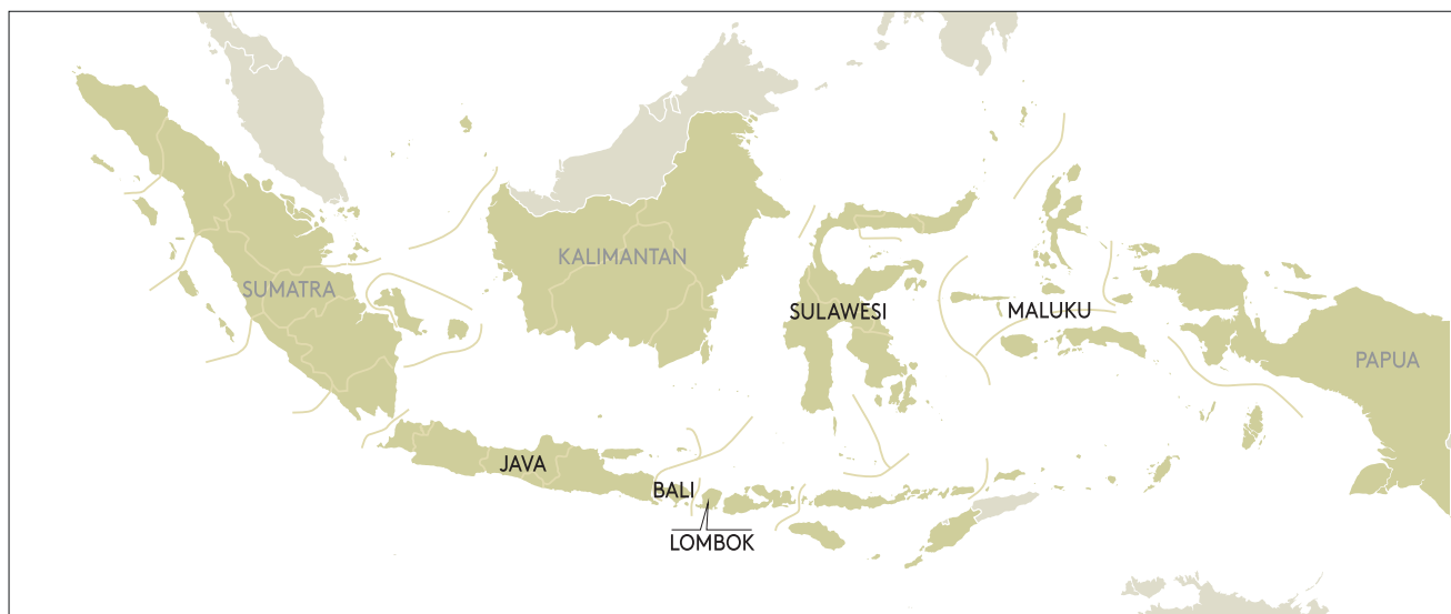
Figure 1. Locations of the initiatives examined in the research.