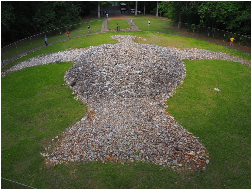
Excursion to Rock Eagle Effigy Mound, Putnam County, Georgia