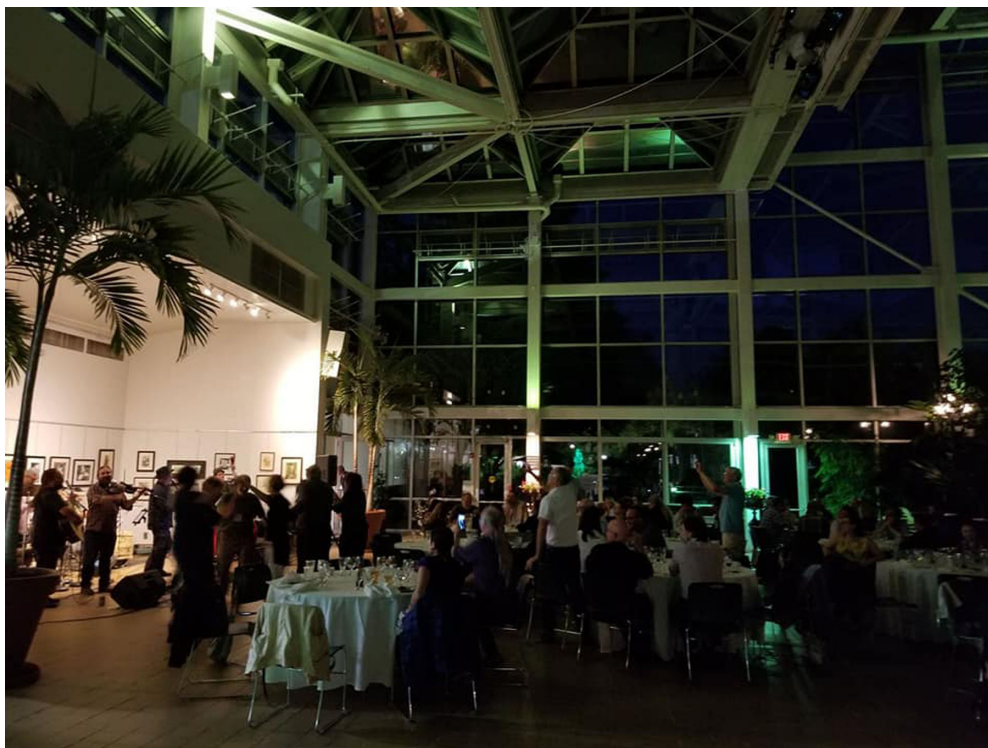
Gala dinner at the State Botanical Gardens of Georgia