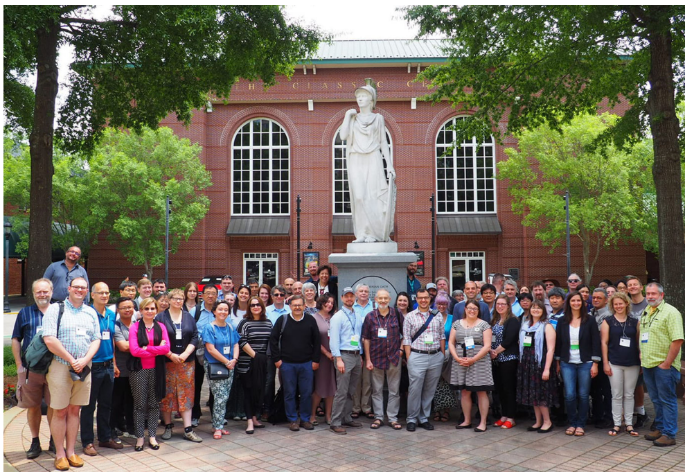
Participants of the 9th Radiocarbon & Archaeology International Symposium. University of Georgia, May 2019, Athens, Georgia, USA