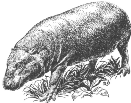
PYGMY HIPPO of west Africa

On the other hand they could appear somewhat bare, dry and, as a set, expensive to the general reader. So the compilers of this volume have hit on the genial idea of adapting them for public consumption, outlining what is known not only of the present status of each threatened creature, by species or subspecies, but of how – so far as is known – it came to reach it. This is not a work only of condensation, but of adaptation, often, in the more spectacular cases, involving enlargement and resulting in an exciting and dramatic story.