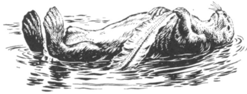
SOUTHERN SEA OTTER of the Californian coast

and keep him awake. It should be in every school library – in every school-boy community there will be a few who will seek it out and devour it – and the ingenious teacher will find ample material for vivid lessons.