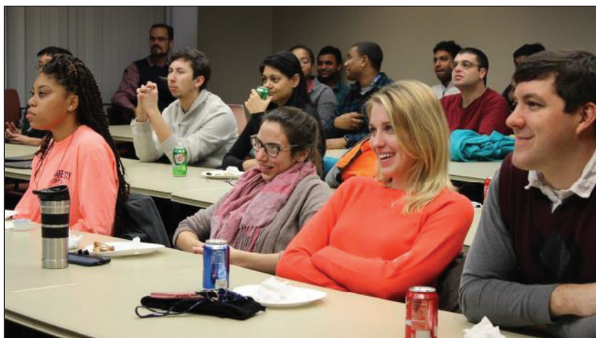
Undergraduate students attended a fun, freestyle question and answer session presented by graduate students about their research and labs as part of the “Chic and Fun Lab Contest” submitted by 2017 MRS University Chapter grant recipient, University of Connecticut.

This outreach project also promotes research and enhances teaching interest among undergraduate and graduate stu-