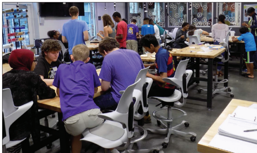
High-school students from lower-income districts completed a circuit building challenge to light up an LED map. This was one of many activities held during “Materials Science Day,” a grant project presented by the MRS University Chapter at The University of North Carolina at Chapel Hill in 2017.

The University of Connecticut will introduce a collaborative graduate student seminar series in which graduate students from a neighboring MRS University Chapter will visit the University of Connecticut and present their research in an invited speaker seminar environment. They will collaborate with MRS members to give presentations about similar topics, comparing and discussing different research aspects and advantages.