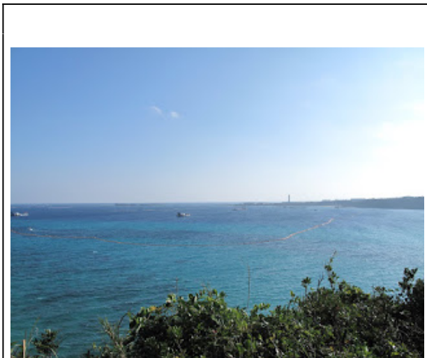
Oura Bay and Base Construction (Feb. 3, 2019)

The Abe government’s admission has placed the government in a difficult situation.