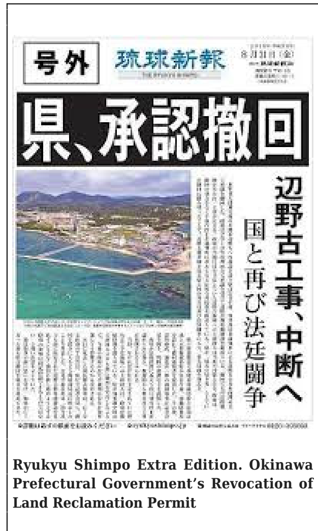
Ryukyu Shimpo Extra Edition. Okinawa Prefectural Government’s Revocation of Land Reclamation Permit

The pretense was made possible by the Okinawa Defense Bureau’s Environmental Impact Assessment (EIA) (2012), which has been vehemently criticized for numerous flaws by experts and environmental NGOs. The government’s admission is the latest blow to the tainted EIA and to the government’s environmental claims concerning the viability of the Henoko-Oura Bay project. The EIA made no mention of the mayonnaise-like condition of the seafloor.