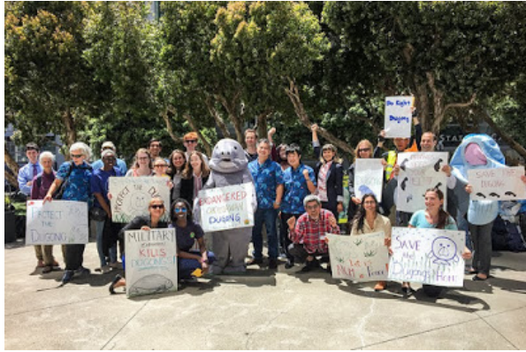
Save the Dugong Rally in San Francisco (June 2018)

Okinawa already has too many U.S. military bases on its soil. The environment of Henoko-Oura Bay, with some 5,300 marine species including 262 endangered species and peaceful communities with rich cultural traditions, is by no means an ideal site for an environmentally intrusive military base and training area. It should be a place for international collaboration for environmental protection and conservation. It is time for the U.S. Government (the executive, legislative, and judicial branches) and IUCN to tell the Japanese Government to abandon this costly and destructive plan.