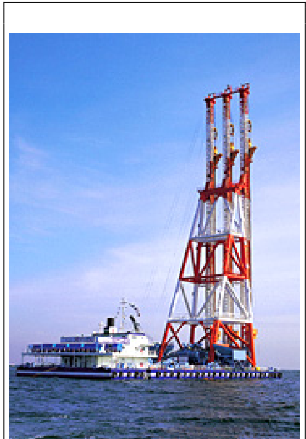
Sand Compacting Pile Method © FUDO TETRA. Original source