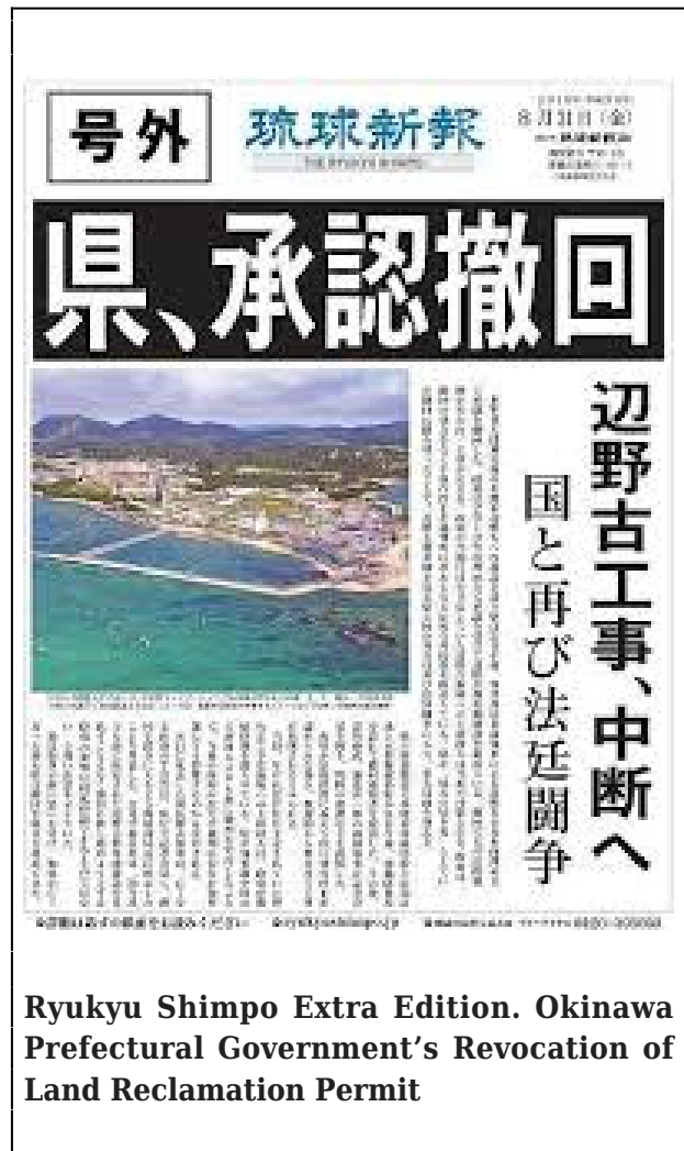
Ryukyu Shimpo Extra Edition. Okinawa Prefectural Government’s Revocation of Land Reclamation Permit

The pretense was made possible by the Okinawa Defense Bureau’s Environmental Impact Assessment (EIA) (2012), which has been vehemently criticized for numerous flaws by experts and environmental NGOs. The government’s admission is the latest blow to the tainted EIA and to the government’s environmental claims concerning the viability of the Henoko-Oura Bay project. The EIA made no mention of the mayonnaise-like condition of the seafloor.