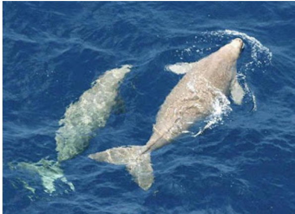
Okinawa Dugongs. The Japanese Ministry of the Environment

Now the Japanese government’s admission calls into question the validity of DoD claims since the DoD heavily relied upon the Okinawa Defense Bureau’s EIA in conducting its study and reaching the no adverse impact conclusion. As mentioned above, the EIA did not mention the fragile seafloor or the need to drive 76,000 piles in the Dugong habitat.