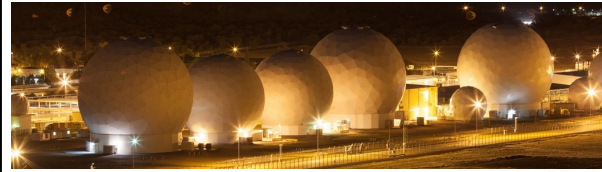
Antennas of Pine Gap

A similar set of defense doctrine contradictions was embodied in the protracted and intense intra-government debate about replacing an ageing small submarine fleet. This was eventually resolved in 2016 with the decision to commit $39 billion to build 12 4,000 tonne conventional diesel-electric submarines based on a DCNS-Thales design derived from the French Barracuda -class nuclear submarine. Once again, doctrinal concerns for a submarine capability designed for defense of the continental sea/air gap and archipelagic Southeast Asian areas of direct strategic interest to Australia appeared to be trumped by advocacy rooted in alliance concerns for capacity to conduct very long-range coalition-support operations centering on a blockade of Chinese waters - a choice with considerable consequences for design requirements and for the Australian strategic relationship with China.