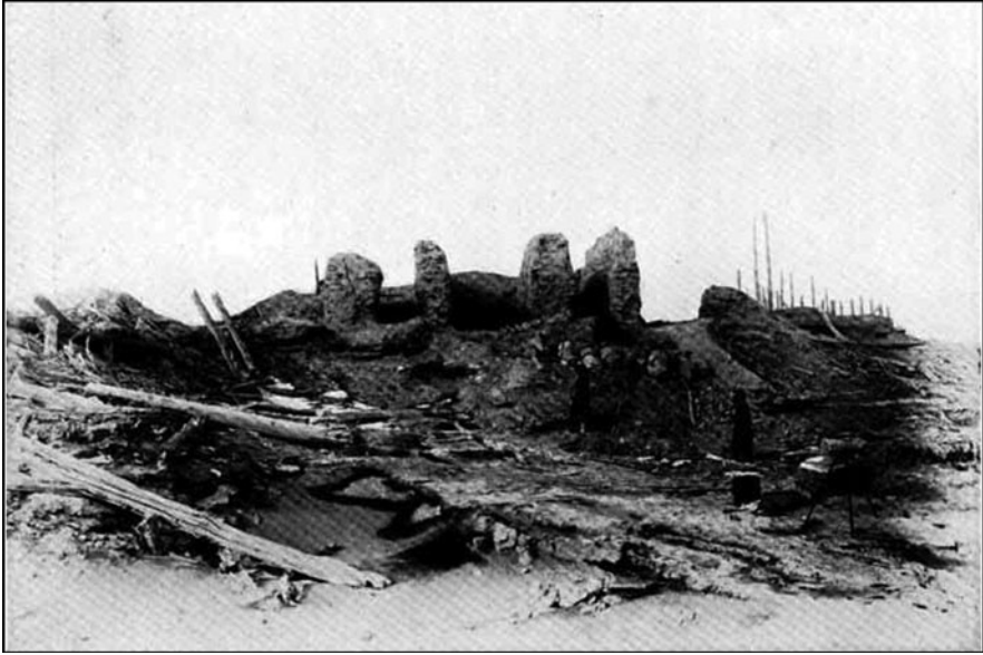
Figure 1. Stein's photograph of the structure in Serindia (Vol. 1, 376). The original caption reads: "South-west wing of ruin L.A. II, seen from the South-east"

of gold diggers (090218), most likely taken in Cherchen. The lower right corner of this last picture has the caption "Mongolia" (written in a different hand, most likely that of an RGS archivist) but elsewhere Tachibana has a detailed description of gold digging in the Altyn Tagh near Cherchen, which is consistent with this photograph: "The way of getting gold dust is extremely primitive. First they dig a deep shaft into the ground, and then they use a bucket to pull up earth and sand from the hole. If they do not find gold among the earth and sand, they dig sideways". 54 The photograph fits perfectly with this description of a primitive goldmine, it is likely that the place name "Mongolia" in the caption is a mistake and the picture was actually taken at Cherchen. In one of his talks, Tachibana also claimed that he had made a ring for himself at this place. 55