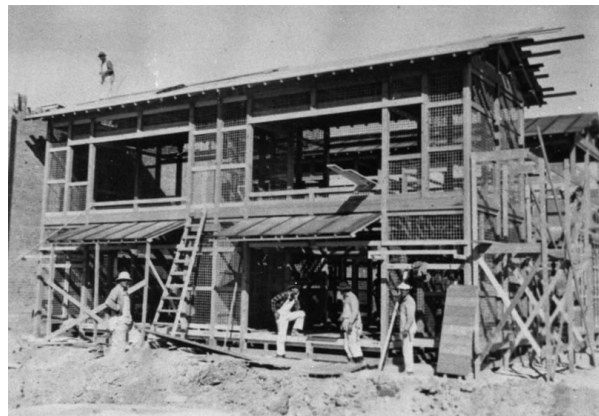
Workers utilize traditional Japanese architectural styles in the Utah Desert, 1943.

All in all, 12 Japanese double-dwellings consisting of 24 tenement-style residences and 6 German apartments were constructed. These structures were designed, according to Standard Oil, to represent living quarters in Japanese industrial districts. No structure meant to represent industrial facilities was built. Emphasis was exclusively on civilian populations.