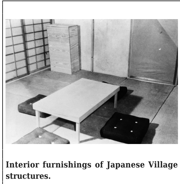
Interior furnishings of Japanese Village structures.

from the Japanese Village for furnishing their own apartments. The most notable inclusion on the list, however, is tatami (straw floor mats).