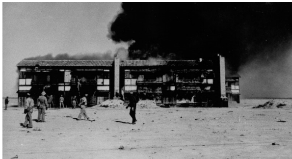
Spectators view the incendiary testing on Japanese Village.

Ultimately the testing erased most of the German-Japanese village. As described by Hottel at a Fire Research Conference in 1983, a large portion of Japanese village met its demise at the hand of a surveyor who waited too long to give the signal for extinguishment. Sometime thereafter, a large portion of German-Japanese Village burned down, consuming the Japanese Village in its entirety. The only remnants of Japanese Village are a few charred but repurposed rafter beams in the two German Village structures left standing today. 69 Workers at the time said now there's "nothing there other than some...scraps." Judging by several interviews with Dugway employees, it seems clear that Japanese Village existed until at least 1950, but was gone by 1952, and that when it did burn down "it burned down so fast and so