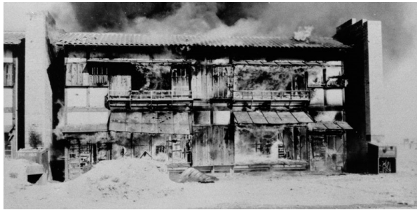
Incendiary testing on Japanese Village.