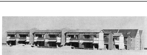
The completed German-Japanese Village.

Results were categorized in three ways: "any fire beyond control of the well-trained and properly equipped fire guards in 6 minutes was classified an A fire; a fire which was ultimately destructive if unattended was a B fire; and a fire judged nondestructive was a C fire." The M-69 produced 37% A fires in German structures and 68% in the Japanese structures, and was judged overall to be the best. (In both cases, the other bombs produced no A fires.) As a result, plans for using the bomb on Japan were drawn up by the Army Air Force as early as the fall of 1943. 68 Tables 1, 2, and 3 summarize comparative data from the UK and US testing, and show how Dugway's testing could have been readily interpreted as the most effective.