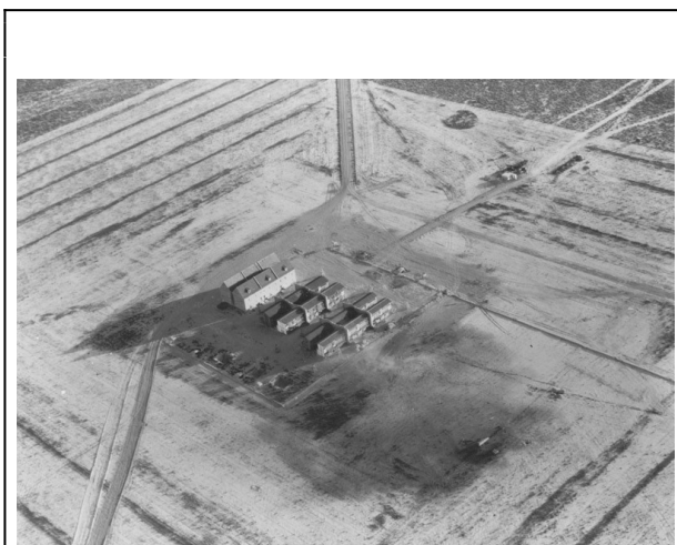
A closer aerial photo of German-Japanese Village where the viewing bunker can be seen.