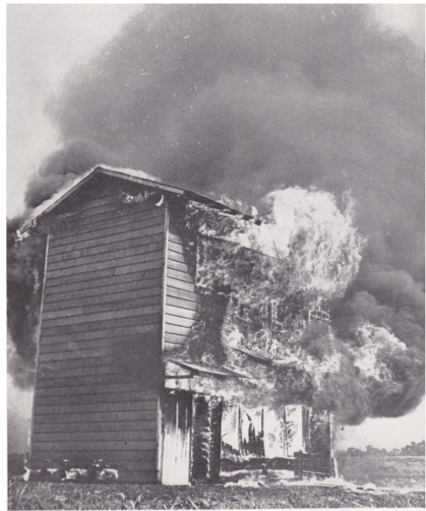
Standard Oil Development Co.

Napalm, firebombing, Dugway Proving Ground, Japanese Village, World War II, precision bombing, civilian bombing, Tokyo air raids.