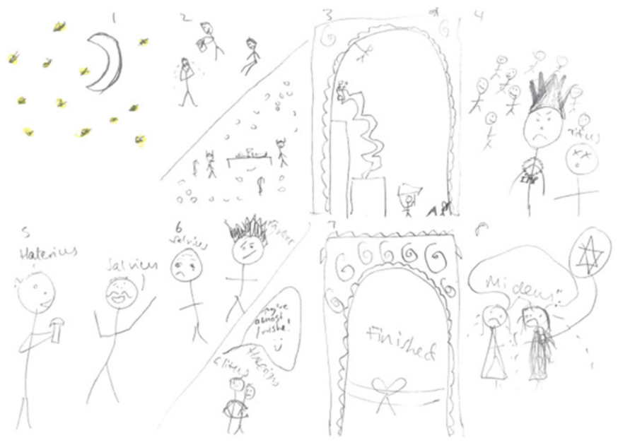
Figure 3. | Sample of student's visualisation of the narrative.