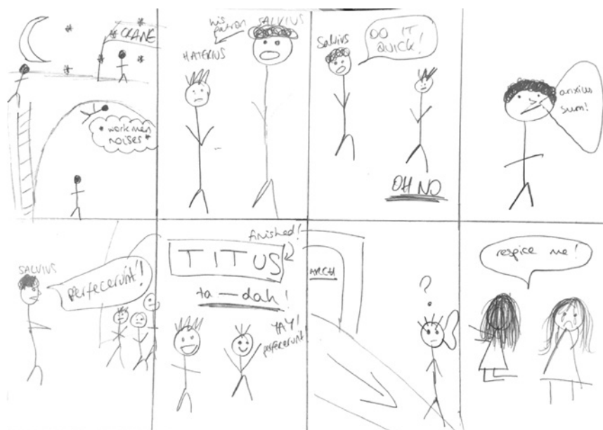
Figure 5. | Sample of student's storyboard of the narrative.

Some students referred to a Grammar A&E lesson which we had done prior to this particular sequence of lessons. Here they did a carousel activity on three different grammar points which I had chosen based on those which they revealed they felt least confident of in their self-assessment questionnaire. They were then allocated a grammar point in pairs on which to write a poster which I then combined into a booklet for them to revise from. A number of students requested that we do more of this kind of lesson as a means of them recapping and solidifying things they may not have internalised the first or second time round. Their desire to use class time to internalise basic language tables is something which will have to be balanced carefully in future.