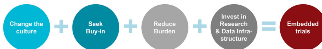
Figure 1. Improvements for overcoming barriers to conducting embedded trials.

EHR, electronic health record; NIDDK, National Institute of Diabetes and Digestive and Kidney Diseases; NIH, National Institutes of Health.